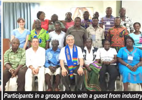
Participants in a group photo with a guest from industry

season. The tour was jointly organized by USAID/Ghana SFMP and the World Bank's West African Regional Fisheries Program.