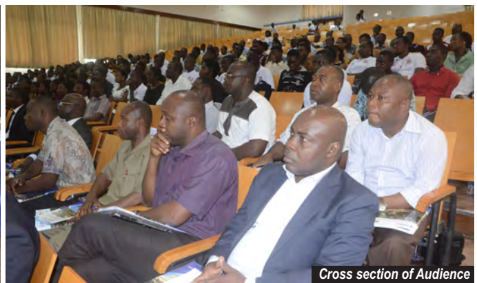
Cross section of Audience

T he Minister of Fisheries and Aquaculture Development, Hon. Sherry Ayittey has pledged govern-