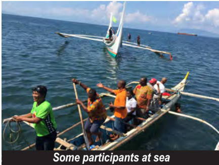
Some participants at sea