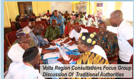
Volta Region Consultations Focus Group Discussion Of Traditional Authorities

A series of regional stakeholder consultations conducted by SFMP partner Friends of the Nation (FoN) mid-2015 have revealed that business as usual is no longer the way to go. The various fisheries associations, including canoe fishers, inshore, industrial and trawlers and women processors, among others, are now ready for change!