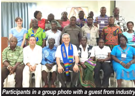
Participants in a group photo with a guest from industry

season. The tour was jointly organized by USAID/Ghana SFMP and the World Bank's West African Regional Fisheries Program.