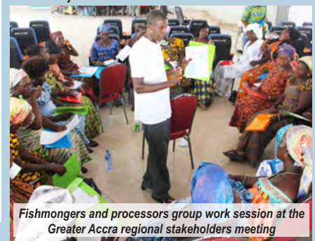
Fishmongers and processors group work session at the Greater Accra regional stakeholders meeting

These stakeholder consultations preceded the national fisheries dialogue and were aimed at providing inputs and supporting the agenda for the national dialogue in accordance with the Fisheries Plan objectives.