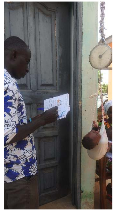
Cheshegu CHPS health worker during ANC, Kumbungu District