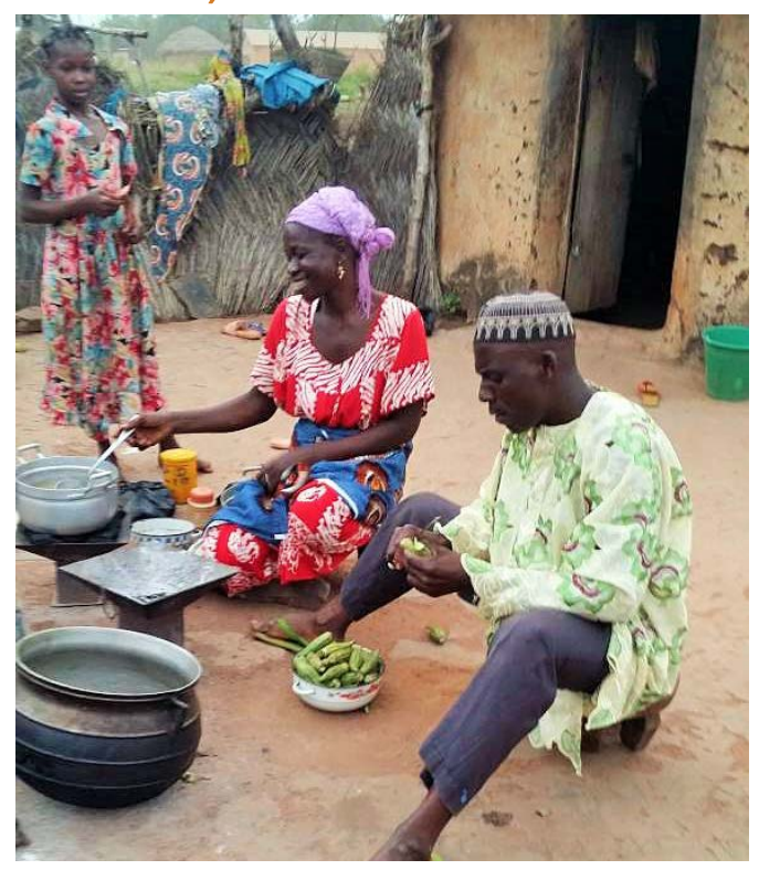
Husband and wife team cooking for the family, Nasamba, Nanumba, South District.