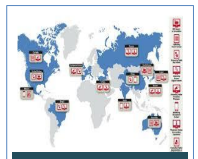
Target Investment & Strategically focusing our resources