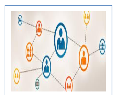
Country & Local Ownership