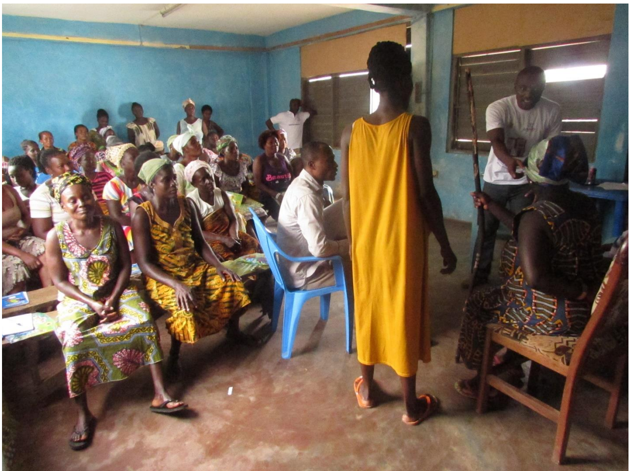
Figure 5 A drama being performed to give a clear understanding of the topic