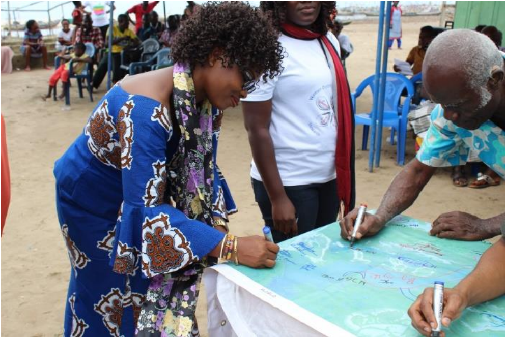
Figure 19: Representative from Ghana Education Service (Ga South Municipal) signing the compact.