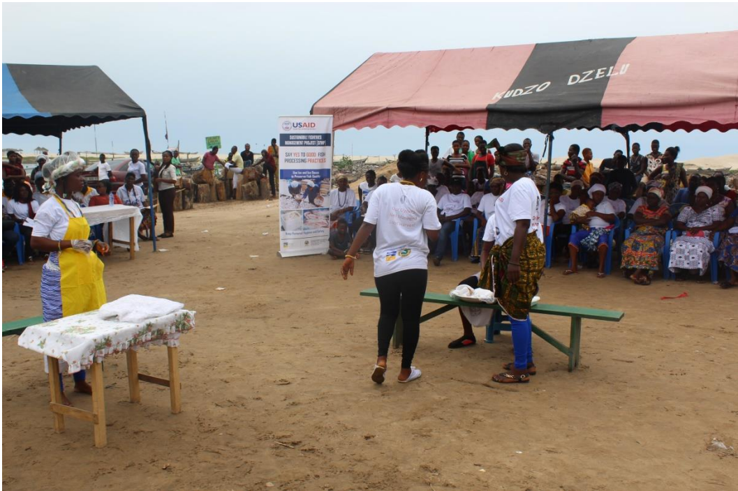
Figure 14: Some members of DOPA entertain the audience and a role play goo