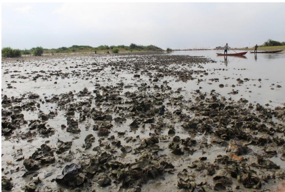
Figure 28: River bed of the Densu Delta at Tsokomey at low tide showing a boost in the oyster population after the closed season observance