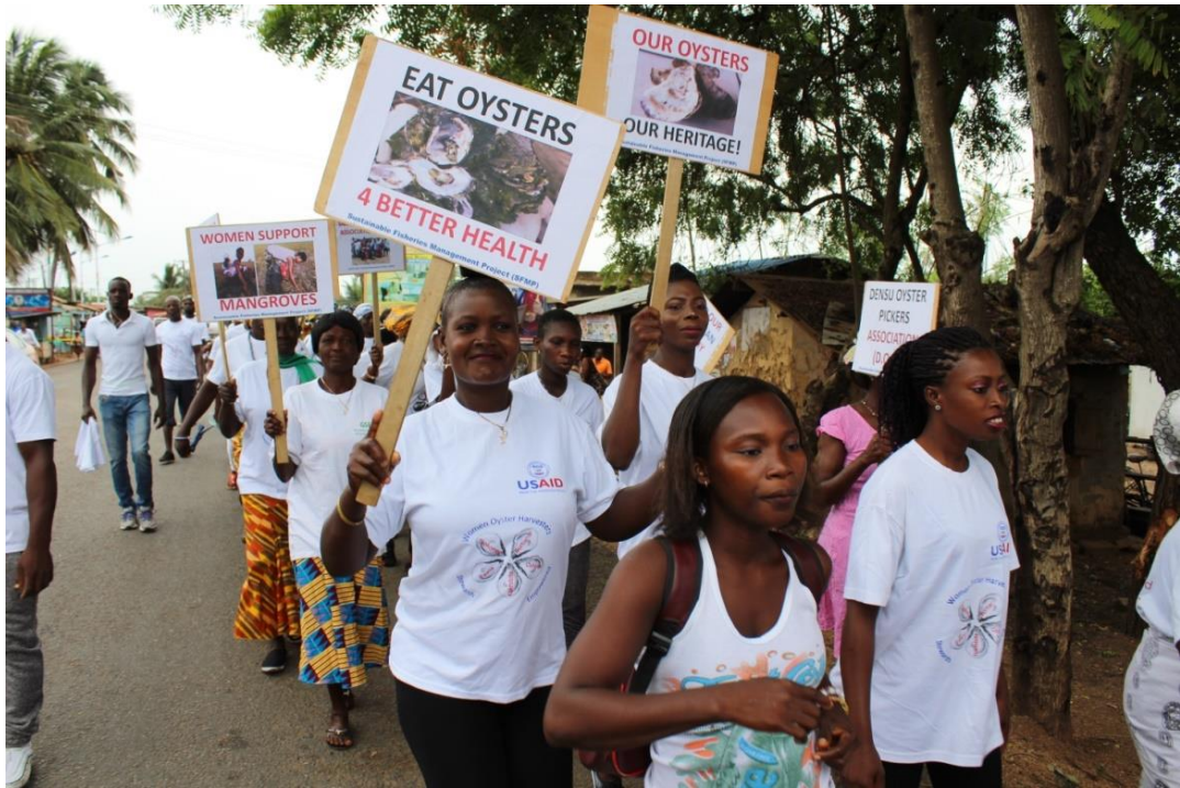
Figure 2: Members of DOPA with their placards during the float.