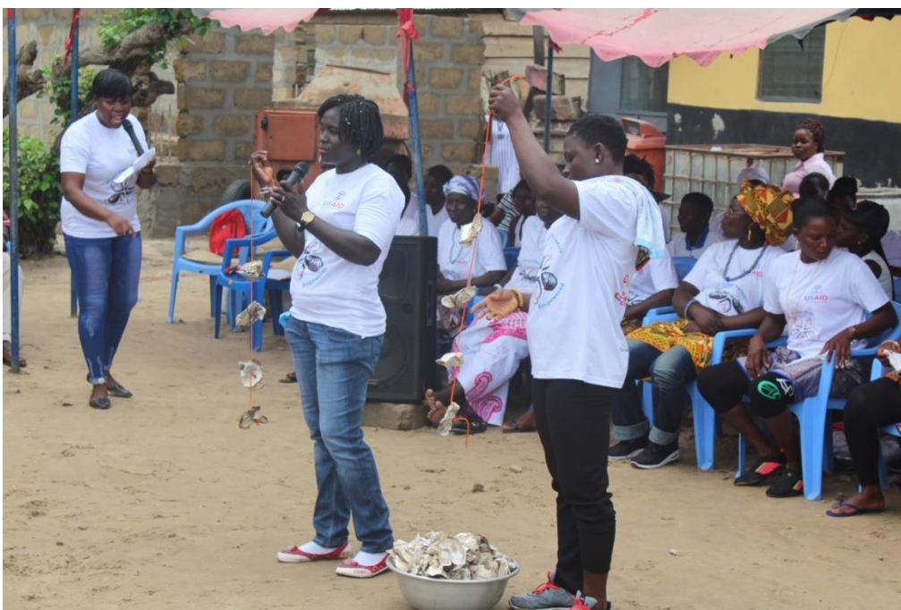
Figure 11: Members of DOPA demonstrating management measures on the Densu Delta.