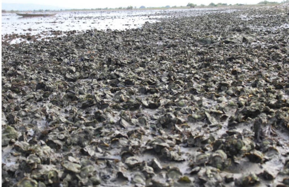
Figure 27: River bed of the Densu Delta at Tsokomey at low tide showing a boost in the oyster population after the closed season observance