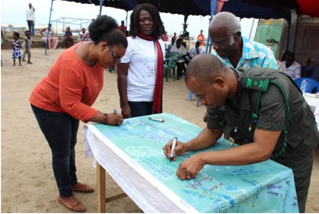
Figure 18: Other stakeholders including Fisheries Commission officers, Forestry Commission (Wildlife Division), Traditional leaders take their turn