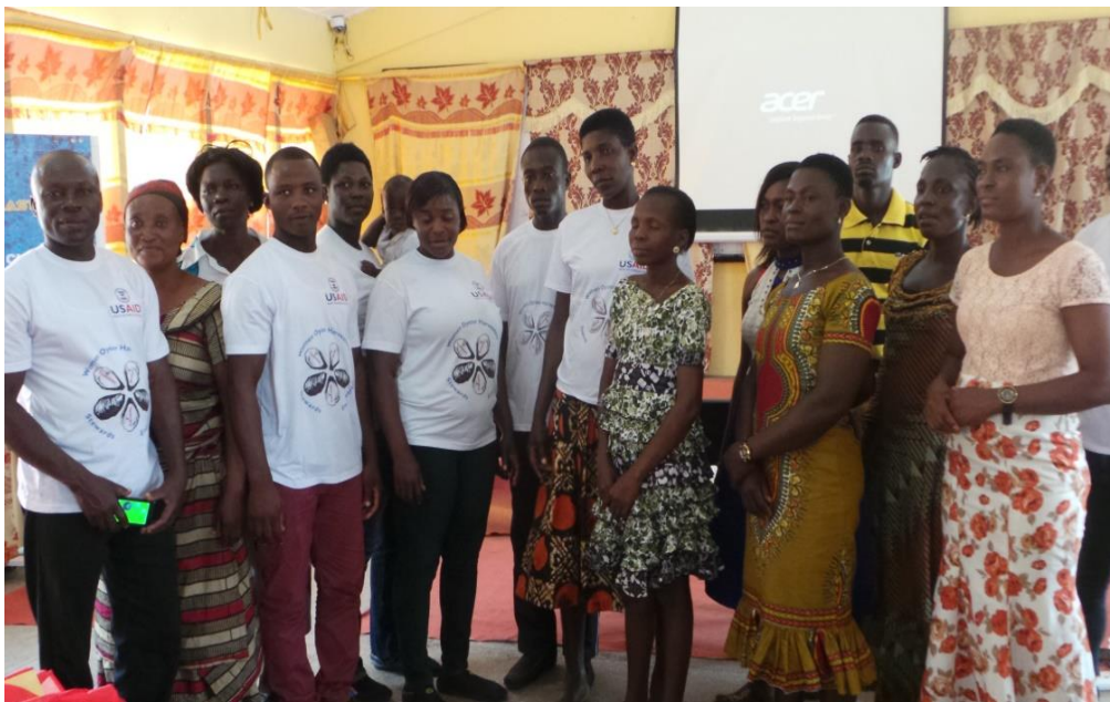
Figure 31: Members of the 15 member Densu Delta Co-Management Committee