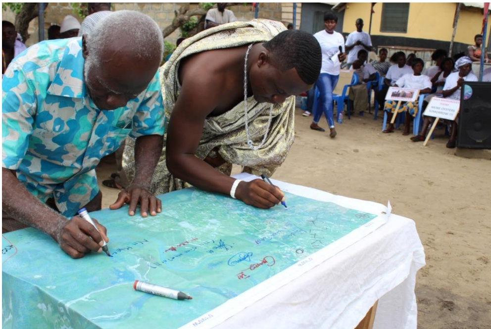
Figure 21: The Chief Fisherman of Kokrobite (right), representing fishers in the areas signs the compact.