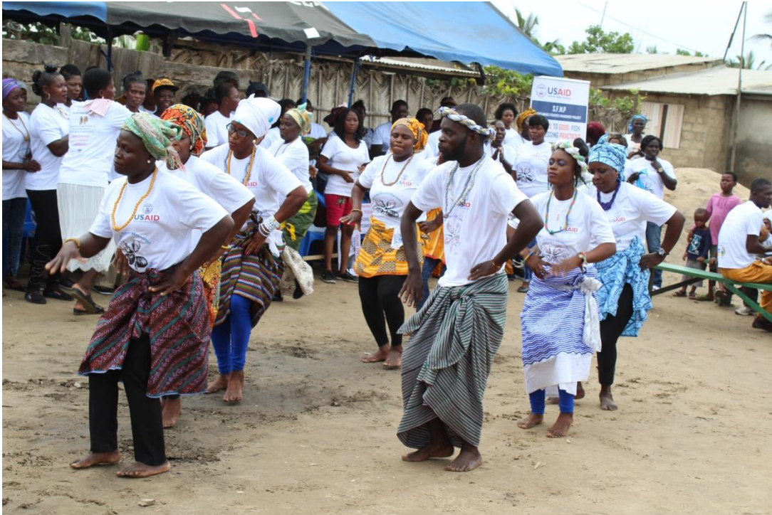
Figure 13: Some members of DOPA entertain in audience with a cultural dance.