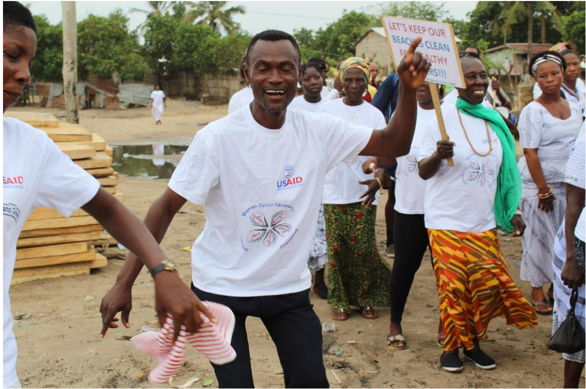
Figure 4: Members of DOPA on a street-walk.