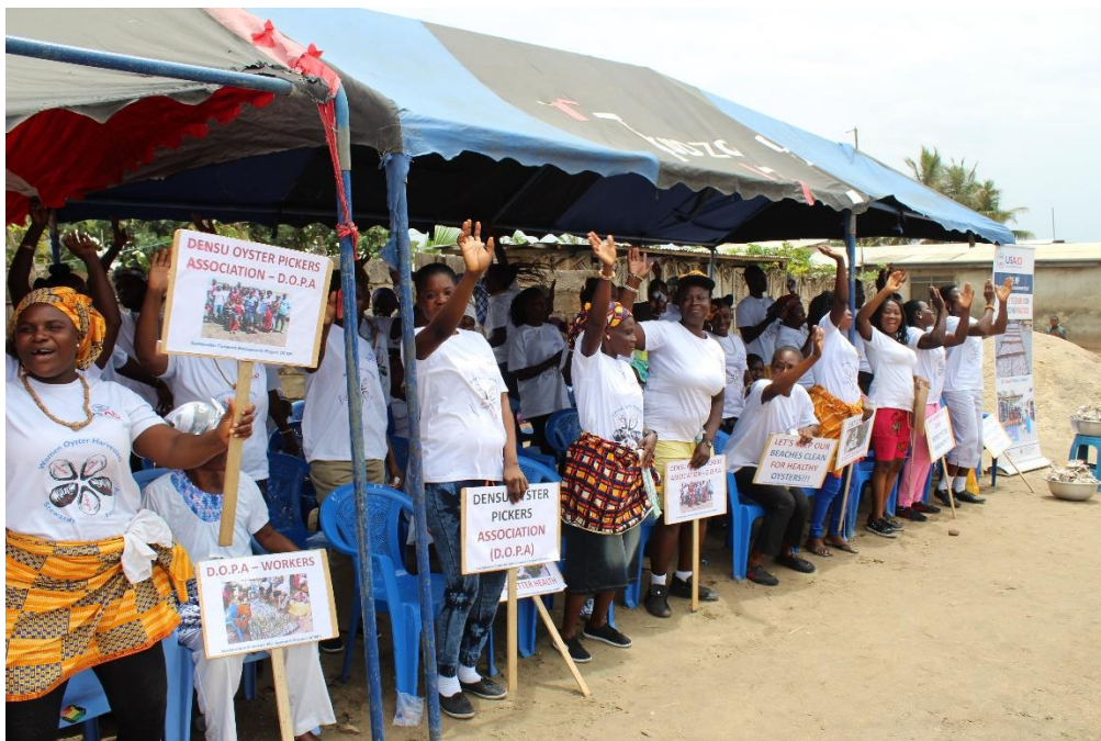
Figure 17: Members of DOPA, in solidarity show by hand their commitment to adopt and implement the plan