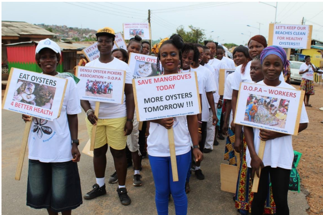
Figure 3: Section of members of DOPA on the walk.