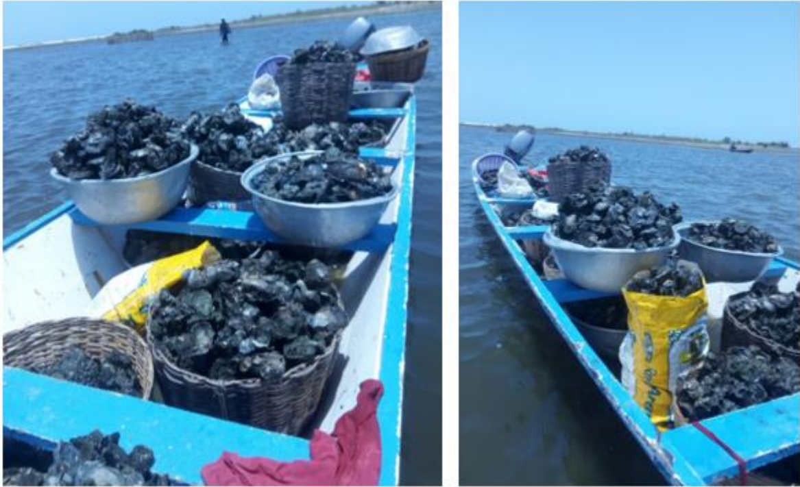
Figure 29: Harvested oyster at the Densu Delta after the opening.