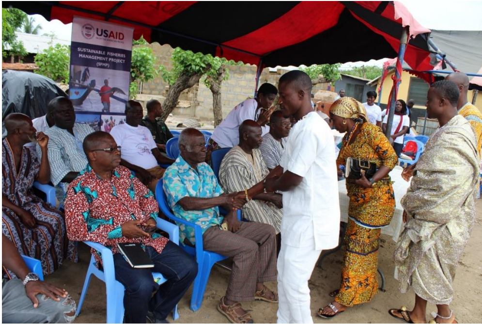
Figure 1: Cross section of stakeholders invited to the event.