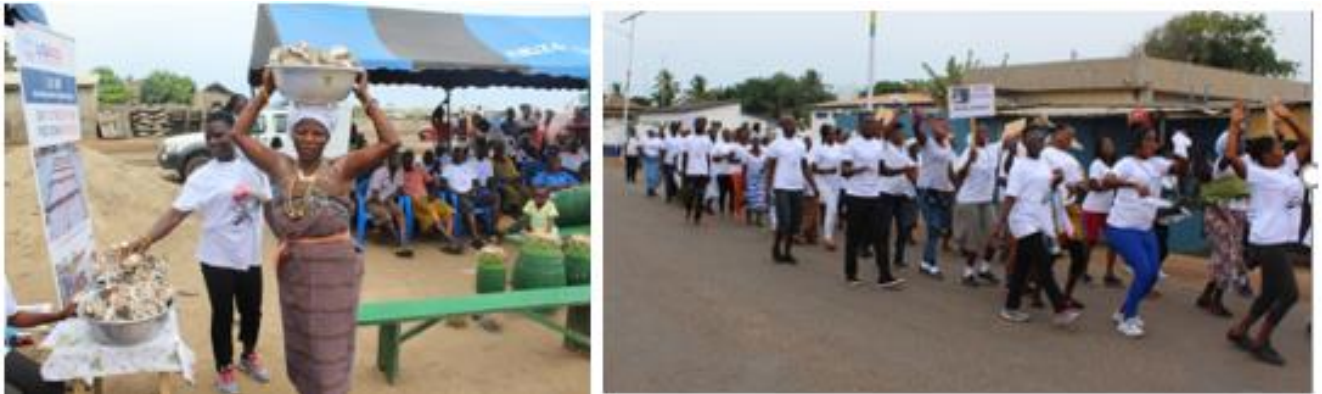
Figure 5: A section of DOPA members on street-walk