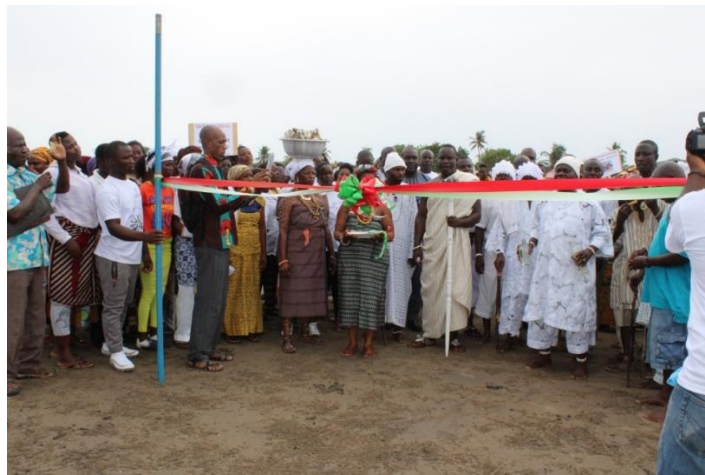
Figure 22: The SakumoWe of the Densu River flanked by the "river priest" Wulomo and other traditional leaders present officially cut the ribbon to signal the beginning of the oyster harvesting activities after the closed season observance.

This was done to institutionalize the practice of closed season on the Densu Delta for oyster harvesting activities during the period set aside by the Densu Co-Management committee. The SakumoWe who is highly revered among the community members led this activity in order to heighten the stature and increase self-compliance among the community folks.