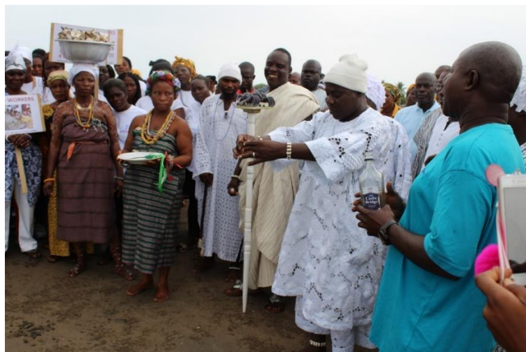
Figure 23: The SakumoWe, pours libation, thanking and asking the "gods" for a bumper oyster harvesting season as he declares the delta open for oyster harvesting activities