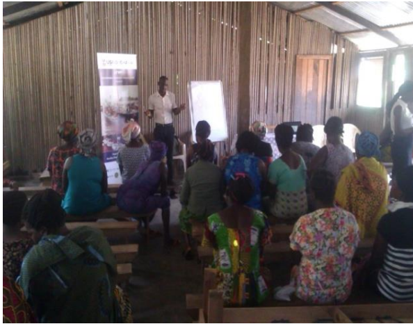
Figure 10 Training sessions in Axim and Ankobra