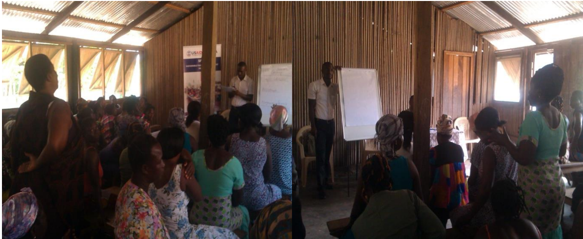
Figure 3 Some of the trainees sharing their expectations