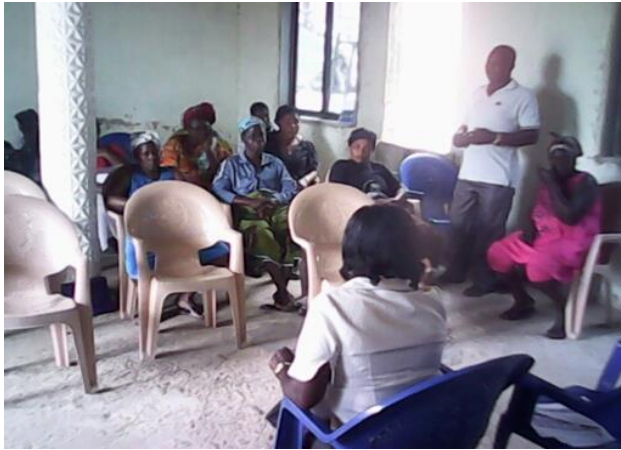
Figure 12 Some of the group members making contribution to the topic (Axim, Ankobra and Shama)