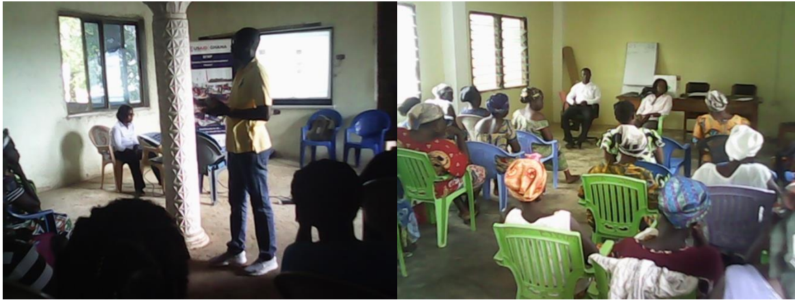
Figure 14 Training sections in Shama, Axim and Ankobra