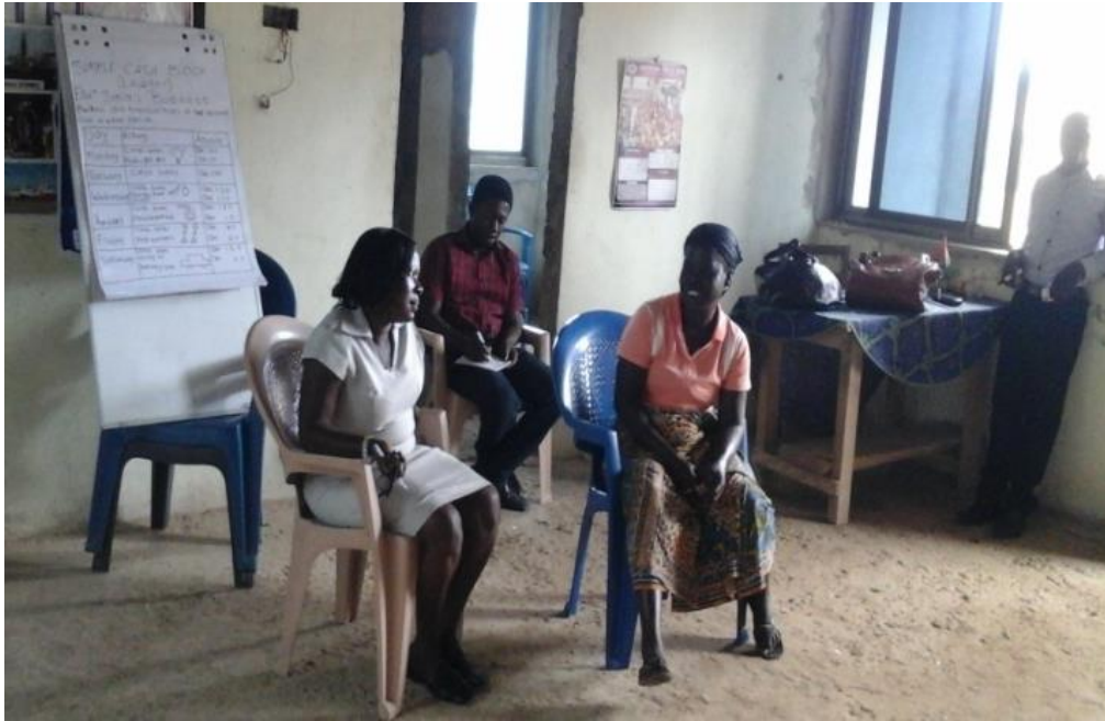
Figure 18 Facilitator and trainee in a short skit on the topic being discussed