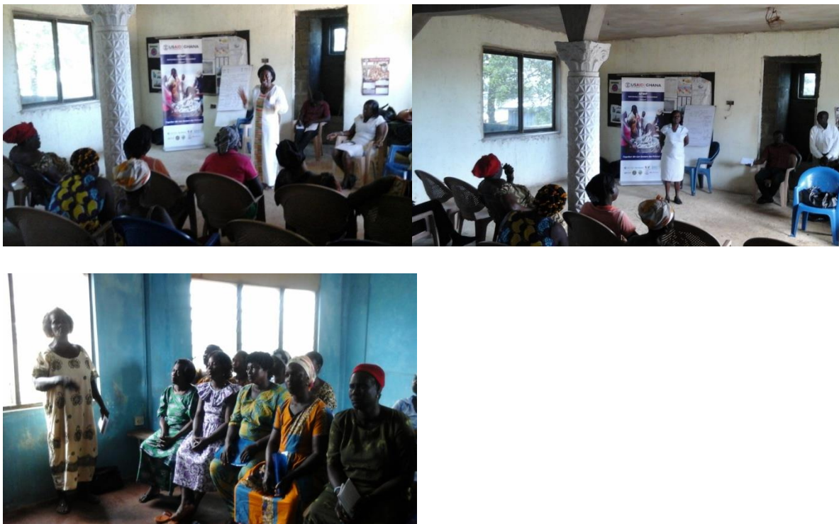
Figure 17 Training sessions (Axim, Shama)