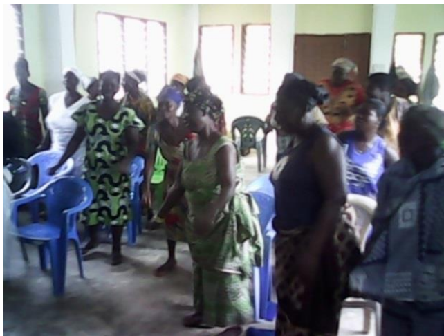
Figure 16 Participants engaged in an energizer

There was a discussion by the trainees on the definition of loan, which was explained as money borrowed for use and repaid to the owner being individual, group or financial institution, after a defined time in the future, usually with interest or a fee charged for the use of the money.