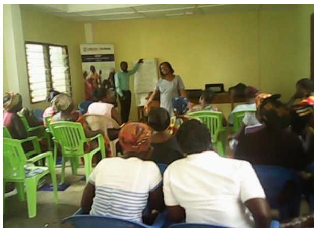
Figure 11 Training sessions in Shama