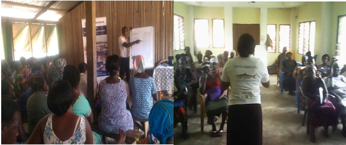
Figure 2 Training sessions in some of the venues (Ankobra and Shama)