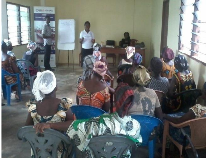
Figure 4 Trainees being taken through group dynamics