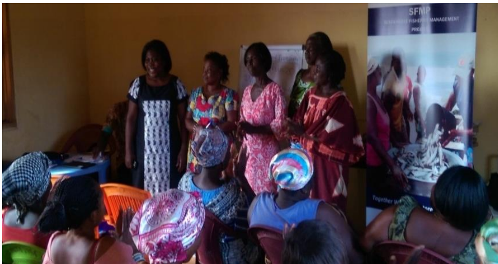
Figure 8 Elected group leaders/ executives being applauded (from left: Executive Director of Daasgift, The group president, treasurer, secretary and organizer; Axim- Fisheries)

The trainees were encouraged to use the knowledge acquired and the criteria they outlined in the election of the group leaders; to vote for people competent to help them achieve their group objective.