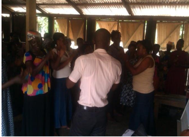
Figure 13 (Top) Trainees making contributions to the topic. (Bottom): Participants engaging in an energizer