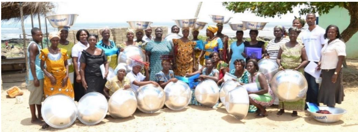
Figure 19 Beneficiaries of MSMEs display inputs supplied after successfully completed 8 weeks of Business Development Training at Shama-Bentsir.

Daasgift has supported 23 MSMEs with inputs to aid in their business operations