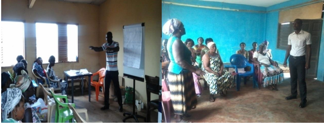
Figure 15 Training sessions in Axim and Shama