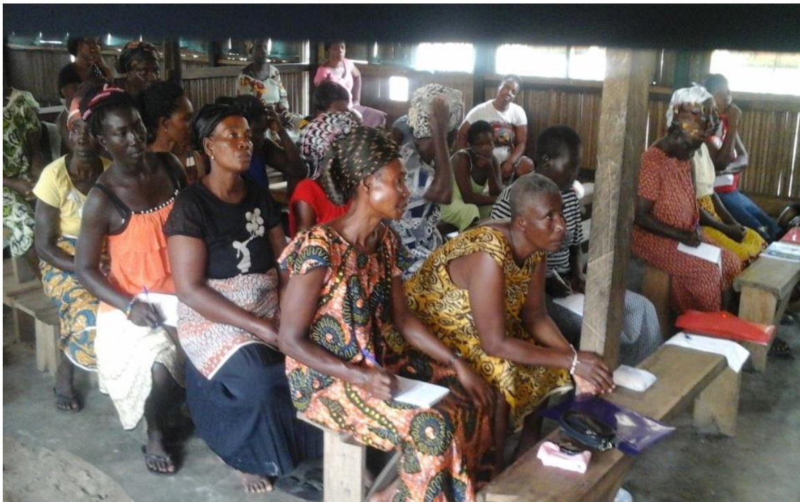
Figure 6 Trainees listening attentively and taking notes (Ankobra)

The second week training program was organized on the 11 th 12 th and 13 th of August 2015.