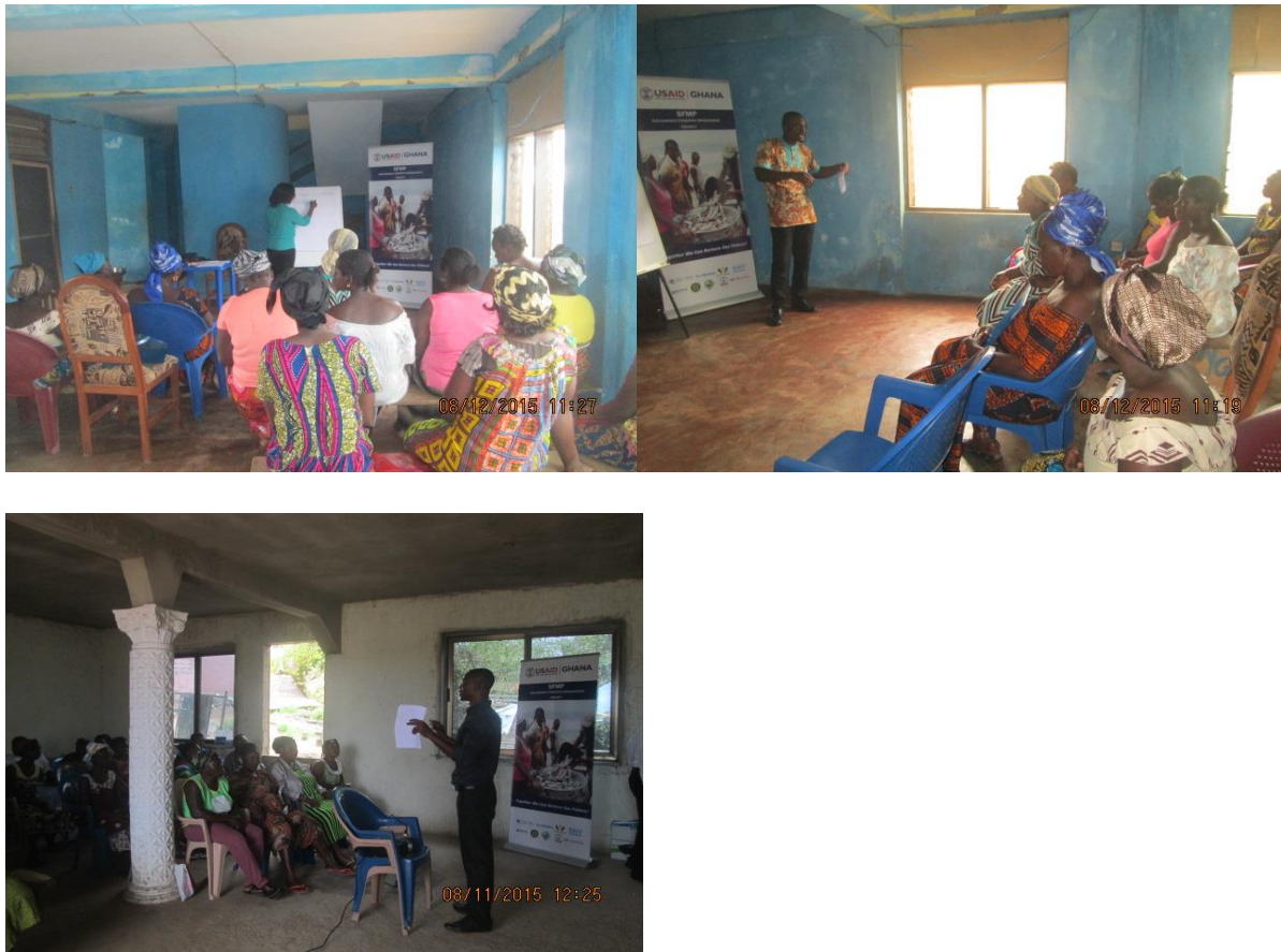
Figure 7 Participants being taken through the week's topic (Shama, Ankobra and Axim)