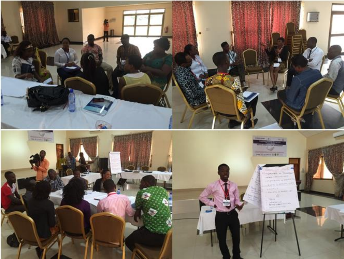
Figure 5 Break out session and presentation