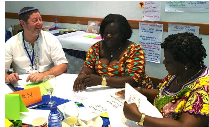
Figure 4 Women processors contributing ideas