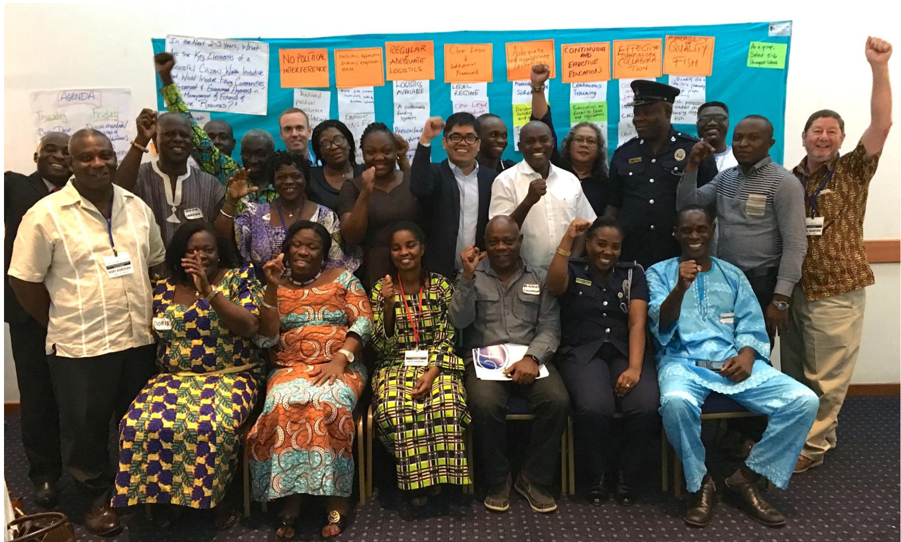
Figure 2 Workshop participants