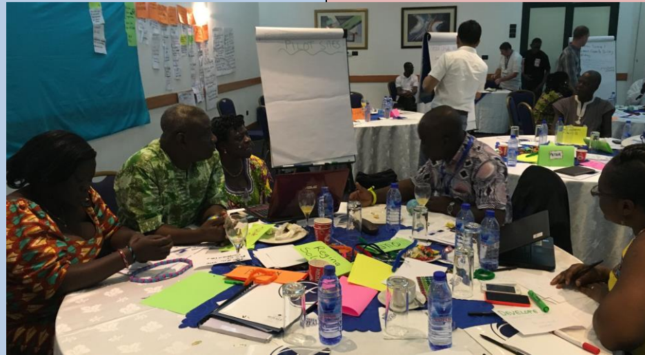
Figure 7 Identifying the tasks to carry out in the first year of the CWOW