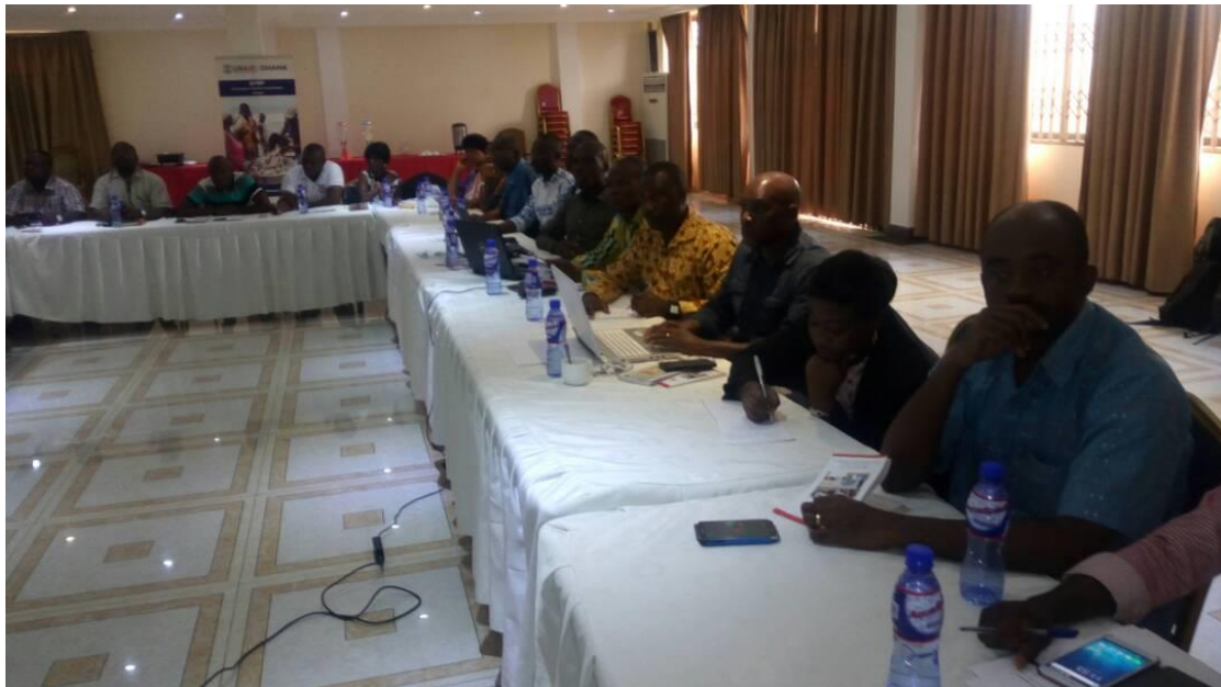
Figure 4. Pictures of participants at the action planning session