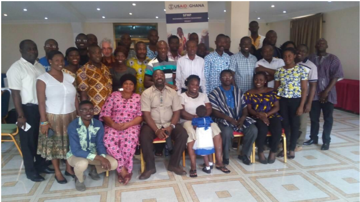
Figure 2. Group picture of participants

The meeting concluded with an action plan that outlined additional interventions that Civil Society Organizations and the media could undertake to support the implementation of the NFMP to contribute to sustainable fisheries management in Ghana.