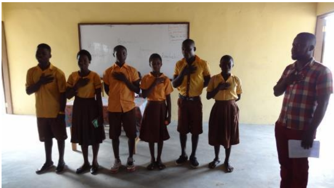
Figure 3: Swearing in of Ampain D/A WMC executives into office

A follow-up meeting was organized to officially inaugurate the school clubs with the swearing in of the leaders. The executives pledged to serve the club and lead other club members to achieve the overall objective of the club. Meeting days for the school clubs were also agreed upon. Club members at Azulenoano SDA and Ampain D/A all agreed to meet on Fridays at 1:00 pm.