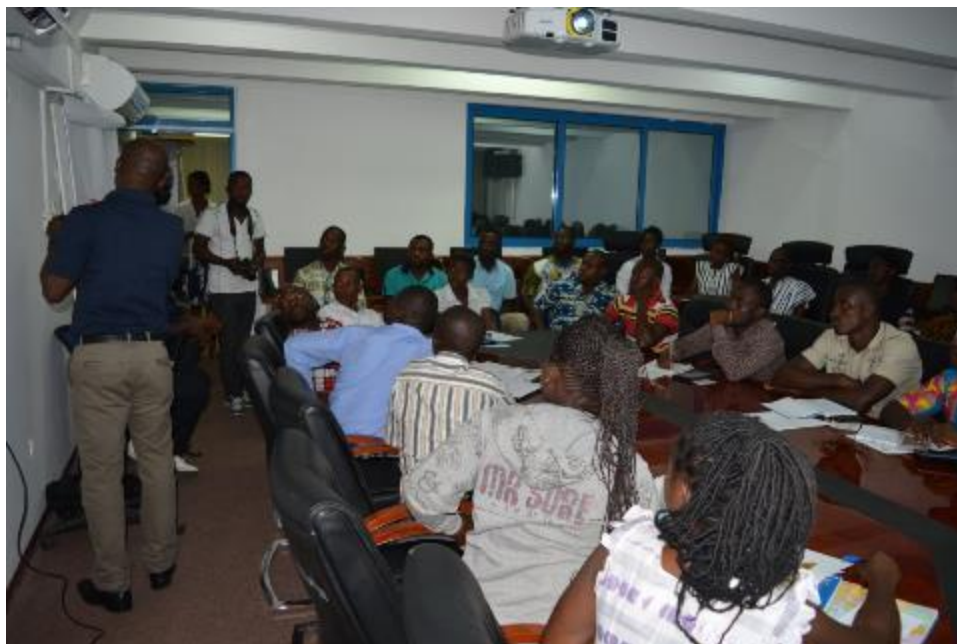
Figure 7: Participants attentively engaged in learning section