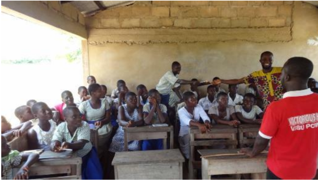
Figure 14: Note books and pens being presented to WMC members