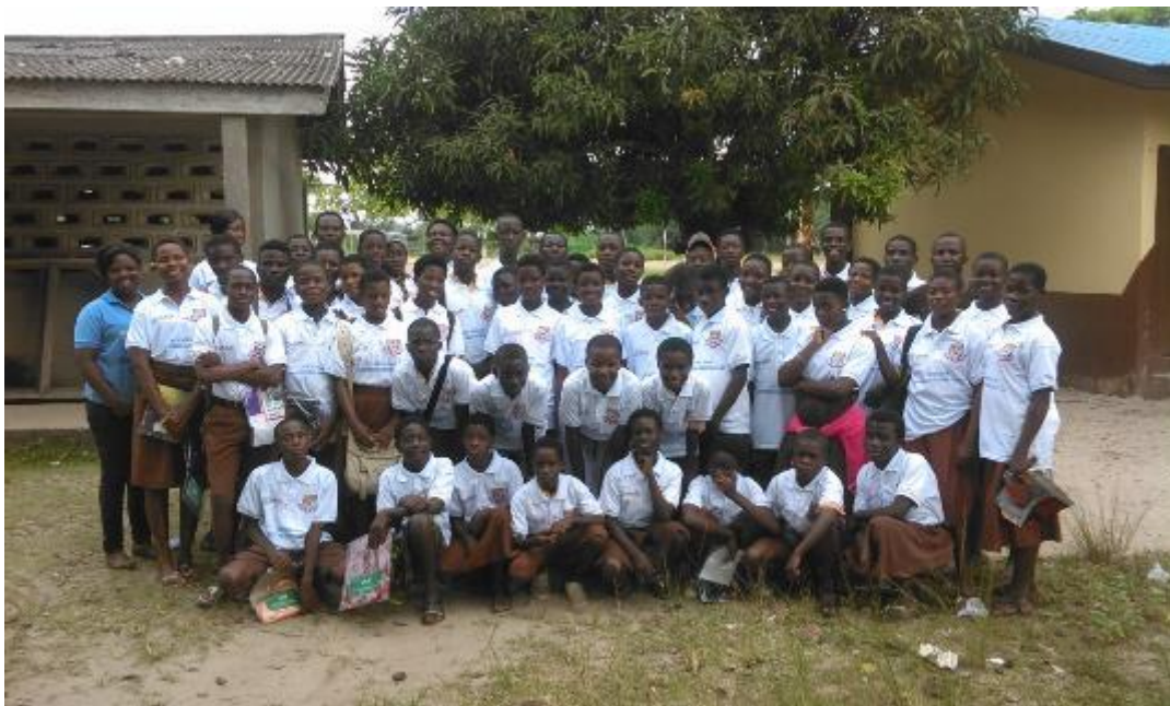
Figure 15: Ampain WMC members