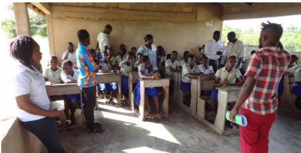
Figure 1: Formation of Wetland Monitoring Club at Azulenoano SDA

Students from both schools were taken through sessions on the importance of wetlands and the need to monitor their health for their sustainable use. Interested students were registered and executives to steer the affairs of the club were elected by the students. Patrons were also selected for the clubs (Annex A & B). The club members comprised Form 1 and 2 students. The Form three students were excluded because they only had some few weeks to complete school.