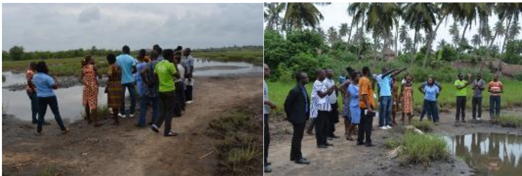
Figure 11: Participants at Abakam flat plains