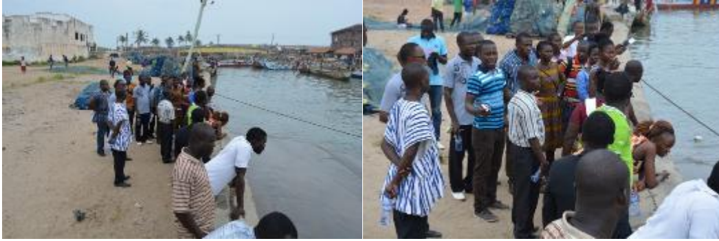
Figure 12: Participants at Benya lagoon at Elmina

These sites were selected to expose the teachers on the various types of wetlands.