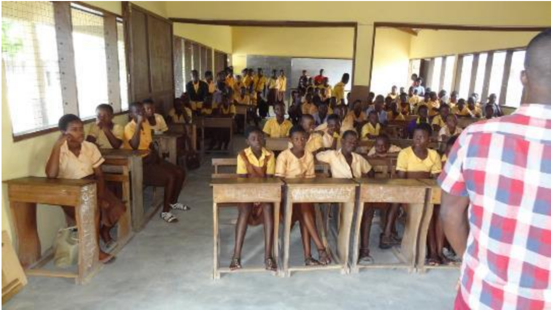
Figure 2: Formation of Wetland Monitoring Club at Ampain D/A

A follow-up meeting was organized to officially inaugurate the school clubs with the swearing in of the leaders. The executives pledged to serve the club and lead other club members to achieve the overall objective of the club. Meeting days for the school clubs were also agreed upon. Club members at Azulenoano SDA and Ampain D/A all agreed to meet on Fridays at 1:00 pm.