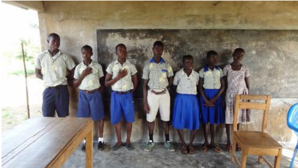
Figure 4: Swearing in of Azulenoano SDA WMC executives into office