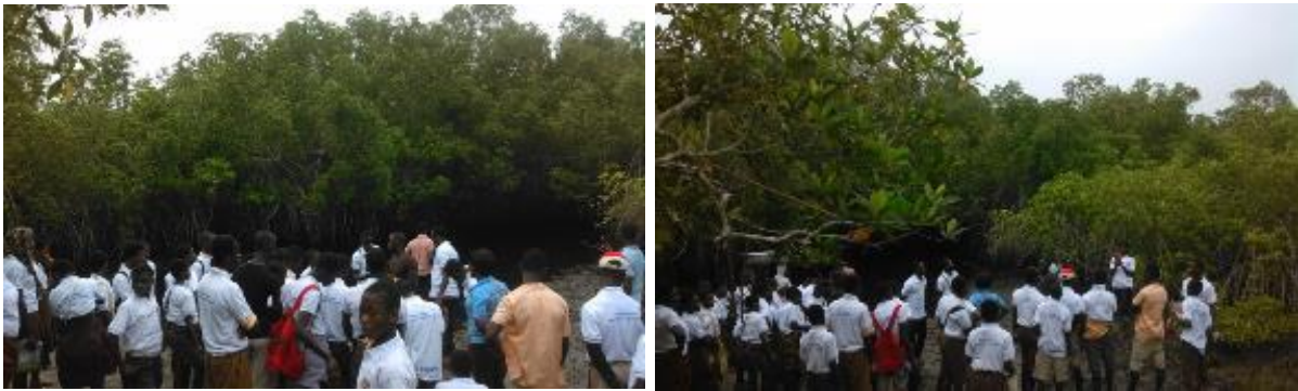
Figure 17: Ampain WMC members on a field visit