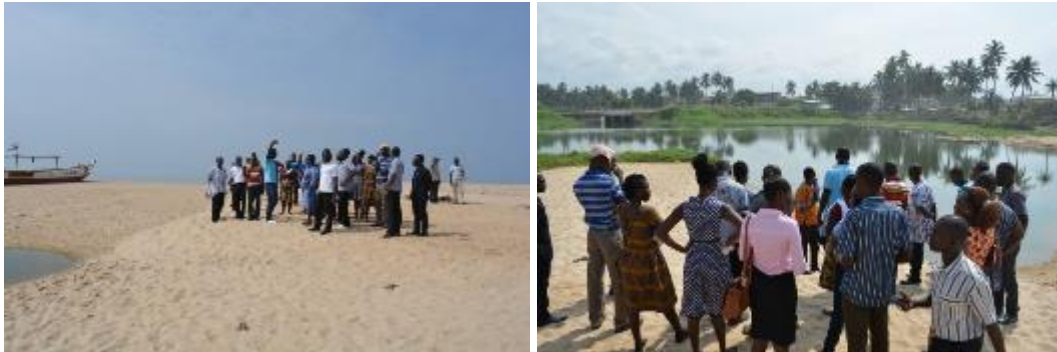
Figure 10: Participants at the Fosu Lagoon