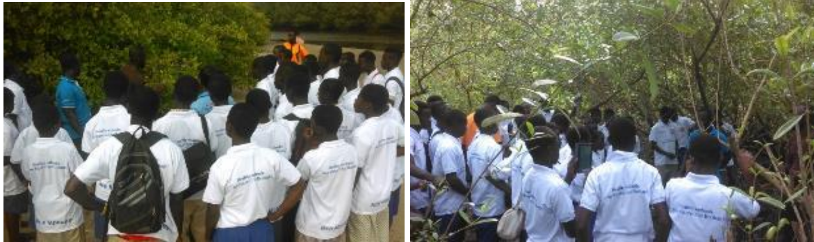
Figure 16: Azulenoano WMC member on the field visit