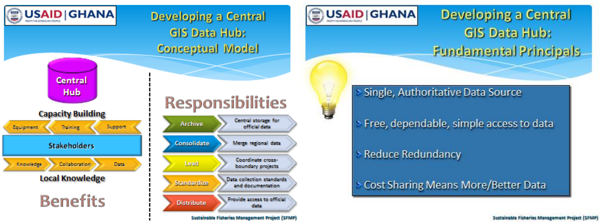
Figure 5 Selected slides from the presentation