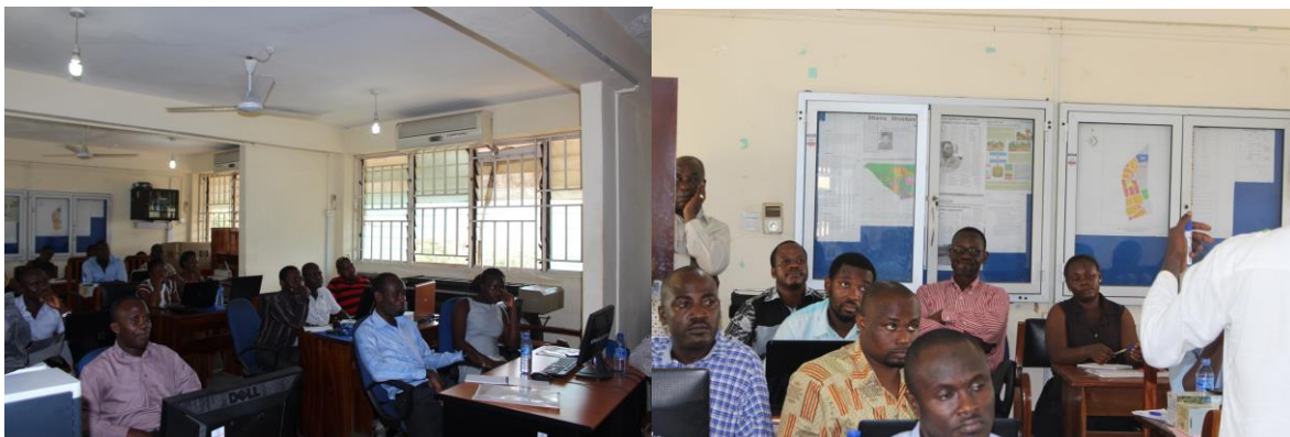
Figure 1 A cross-section of participants at the training

The second session was devoted to classroom trainings and some practical hands-on activities which planners conduct on day-to-day basis.