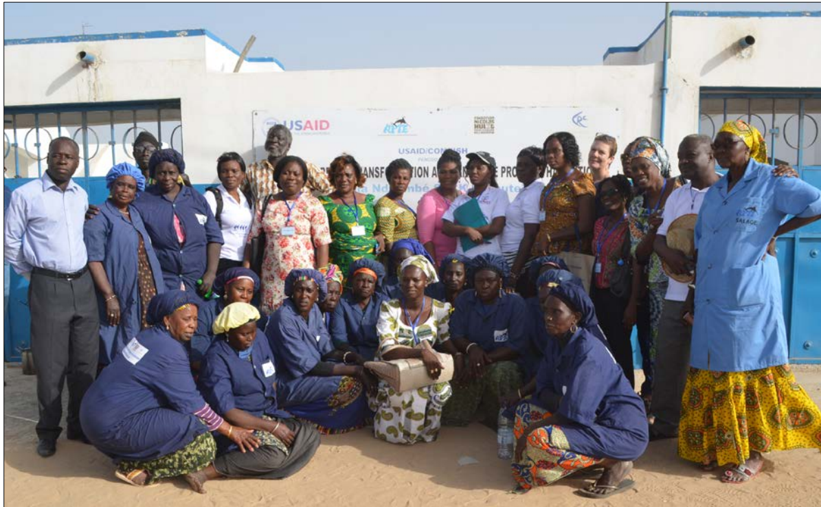
Figure 3. Cayar Women’s GIE members and study tour participants in front of the improved processing center.

The study Tour concluded with a final session at the APTE office in Dakar. Participants reflected on lessons learned and worked in groups by type of organization to develop an Action Plan for implementation of priority actions upon their return to Ghana. The Action Plan is in Annex A. Section IV above summarizes key Lessons Learned. Details of Lessons Learned by type of organization are in Annex B.