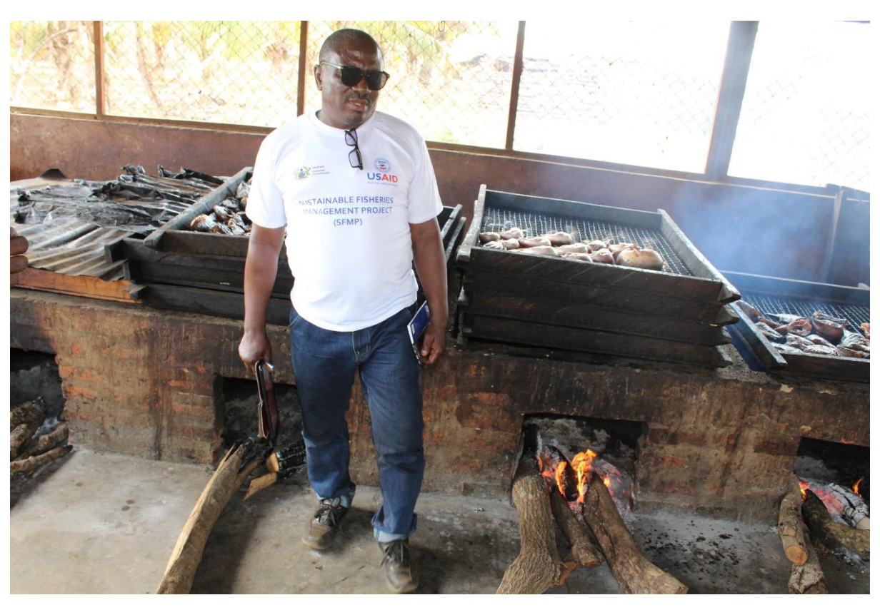
Figure 5 The type of oven used by Torkor Fish processors