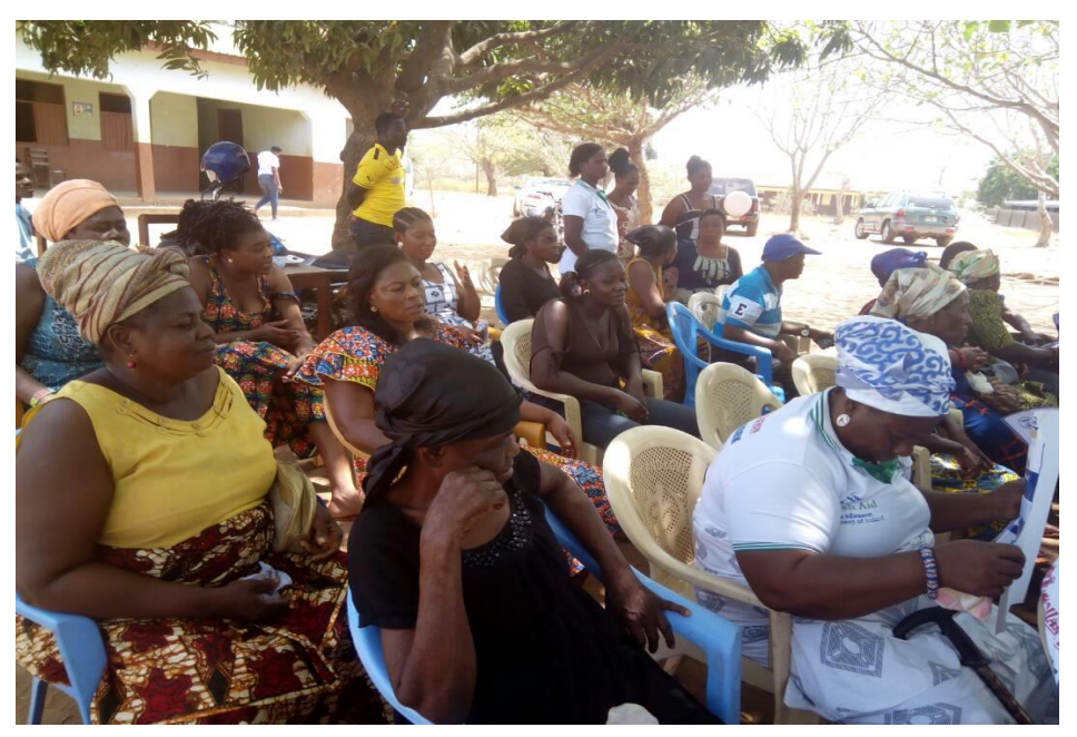
Figure 9 Meeting with members of NAFPTA to educate them about the new fish smoking technology