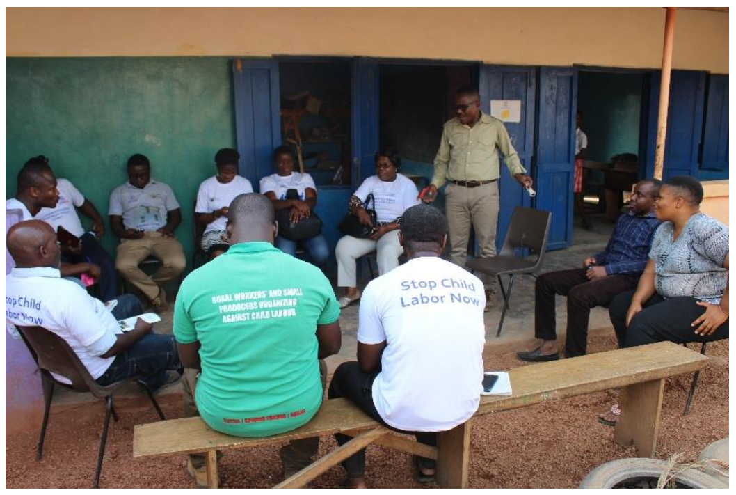
Figure 7 Partners in a brief meeting with the Missahoe Orphanage (One of the orphanages that house the CLaT victims)