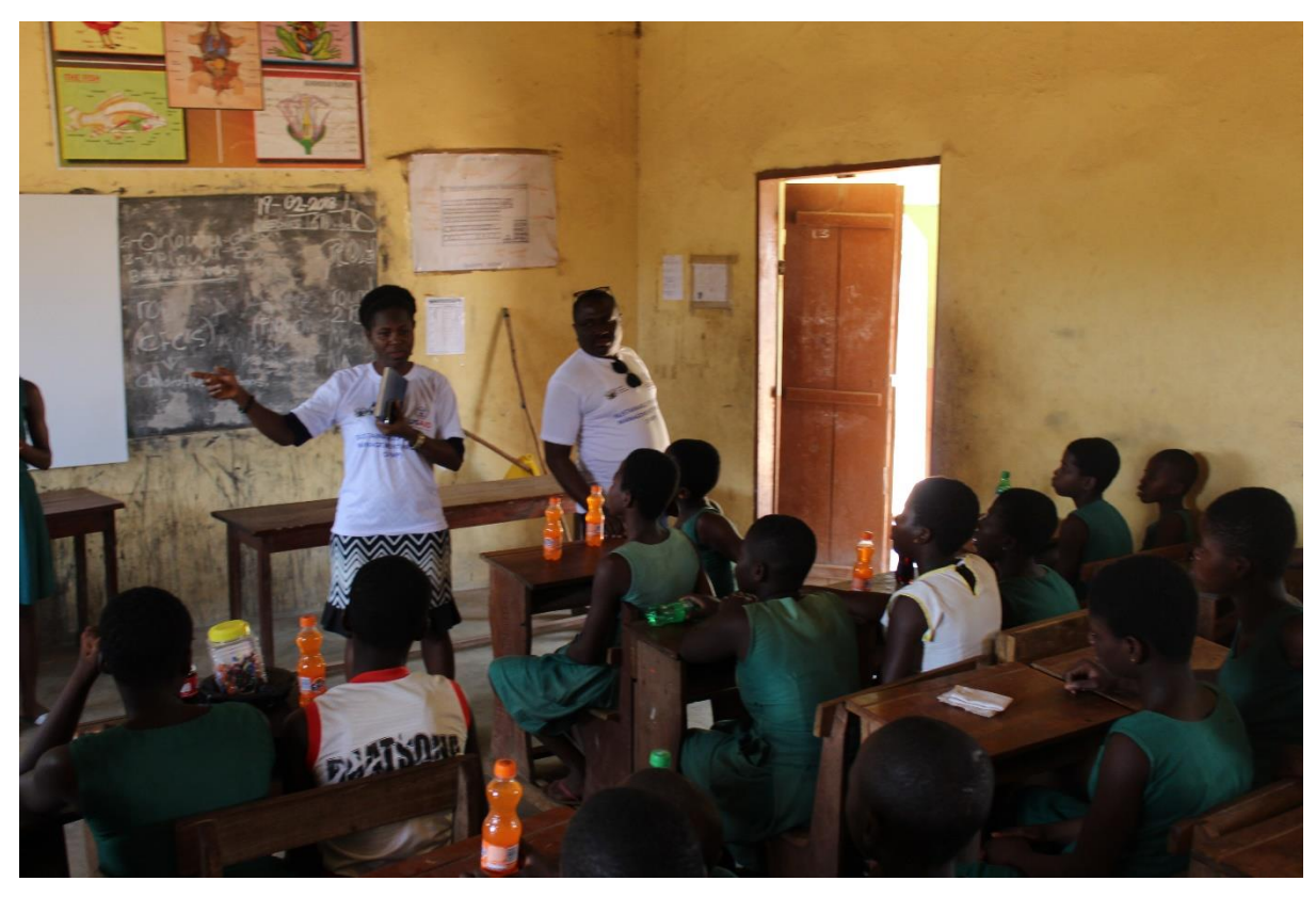
Figure 2 Breakout session with the school children