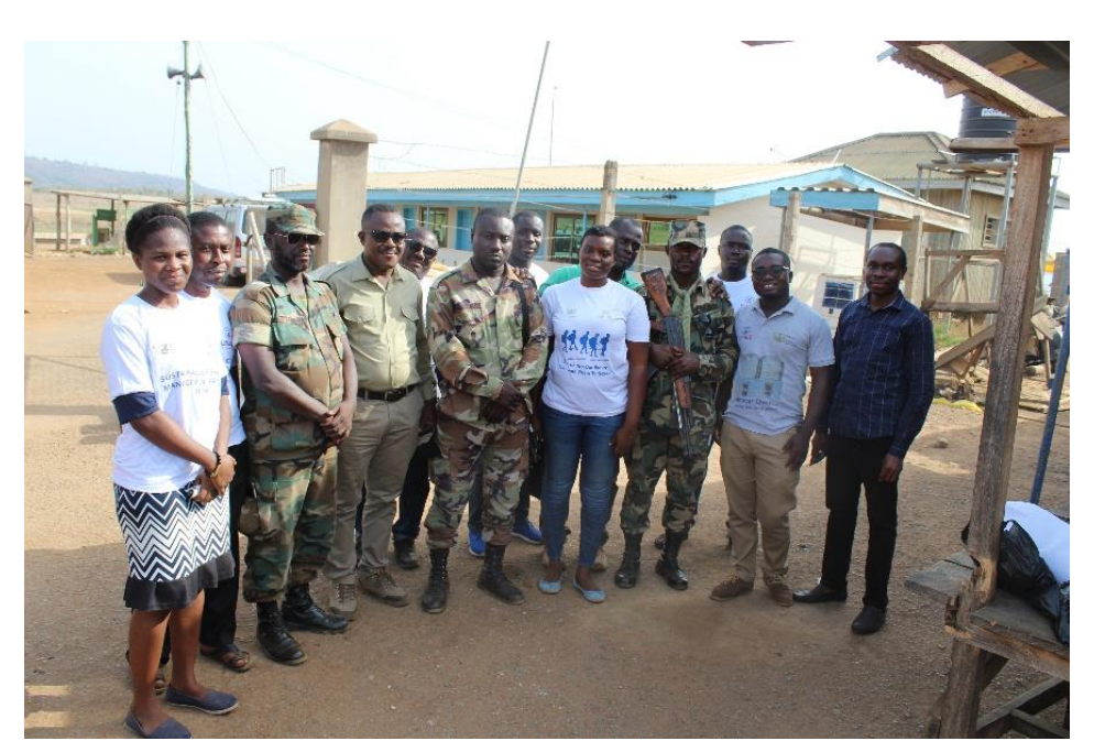
Figure 6 Section of partners in a group picture with the Ghana Armed Forces servicemen stationed at Kpando Torkor