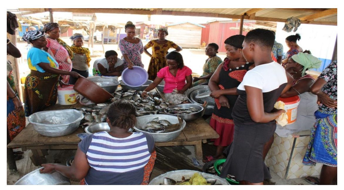
Figure 4 Fresh fish mongers

• The fish after harvest are kept for a long time without ice usage. They were advised to use ice.