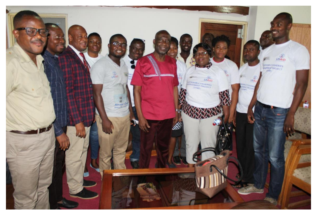
Figure 1 Partners in a picture with the Municipal Chief Executive of Kpando Municipality after the meeting