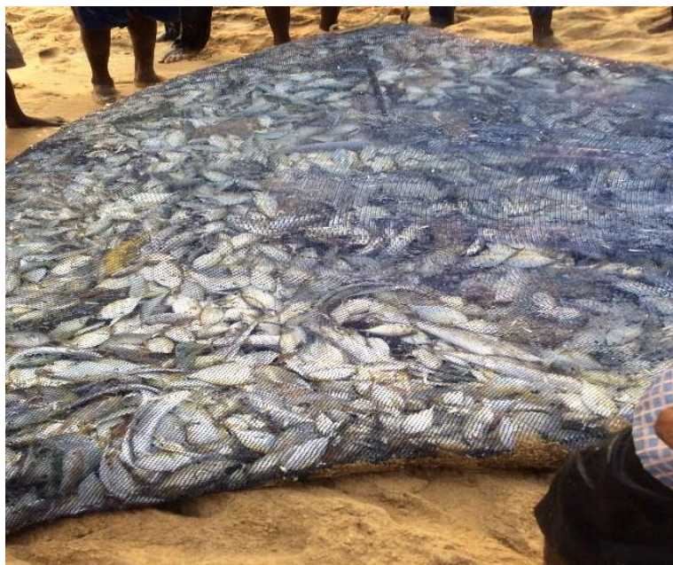
Figure 5. Small fish caught at Anlo Beach using dragnet

group take care of storing the net after every catch. At the end of every season, the net owner pays the group on a share basis. This experience illustrates that community management is being practiced at local level and may be applicable to community-based ecosystem management.