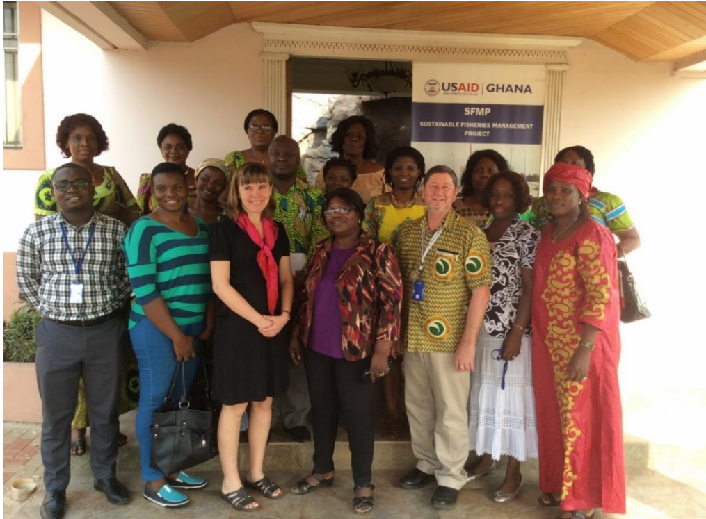
Figure 8. Workshop participants

Women's Civil Society Organizations Championing Best Practices in the Fisheries Sector One Day Follow-up Workshop, 2 ND FEBRUARY, 2017, SFMP Office, East Legon.