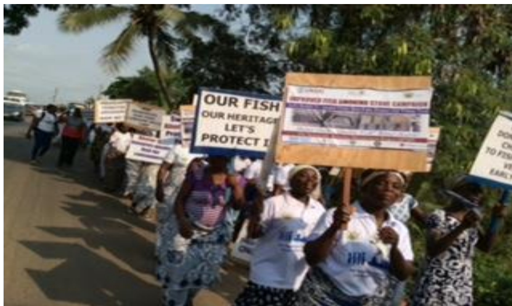
Figure 9. CEWEFIA promotional parade at Moree