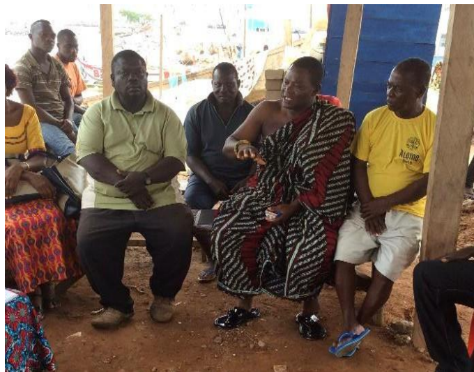
Figure 2. Additional sessions with CEWEFIA management and community leaders at Elmina