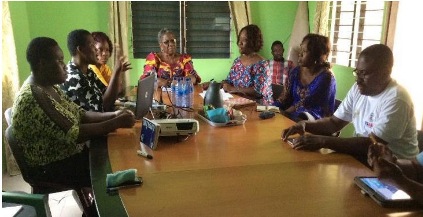
Figure 1. Sessions with CEWEFIA management and community leaders at Elmina