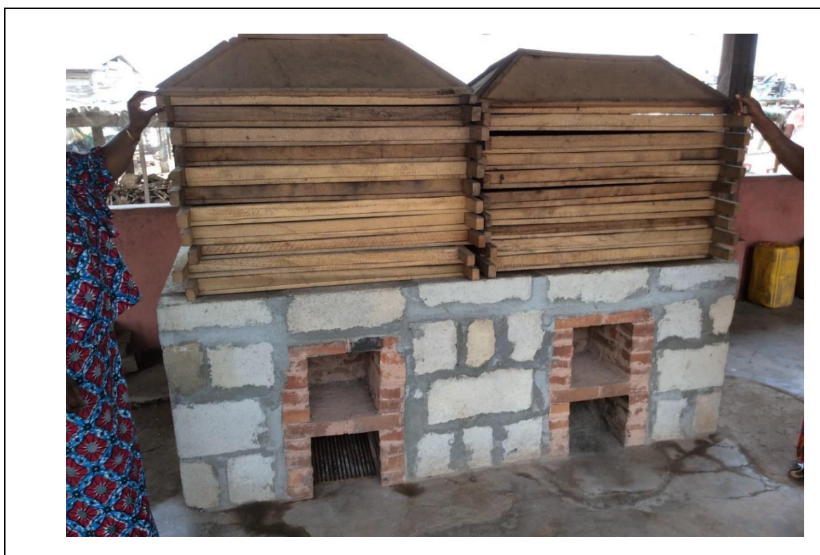
Figure 3. Sample Ahotor oven showing smoking trays and slots for fuelwood

The Ahotor Oven has been developed in partnership with SNV and Fisheries Commission as an improved smoking oven that serves the multiple goals of conservation management through efficiency in fuelwood, consumer preference in taste and appearance of smoked fish, and reduced health risks for women through reduced smoke emission and inhalation. There may be the need to review the design of the Ahotor Oven to minimize labor entailed in the frequent rotation of smoking trays. Some local NGOs also report that the cost of owning the oven may be unaffordable for most women on an individual basis.