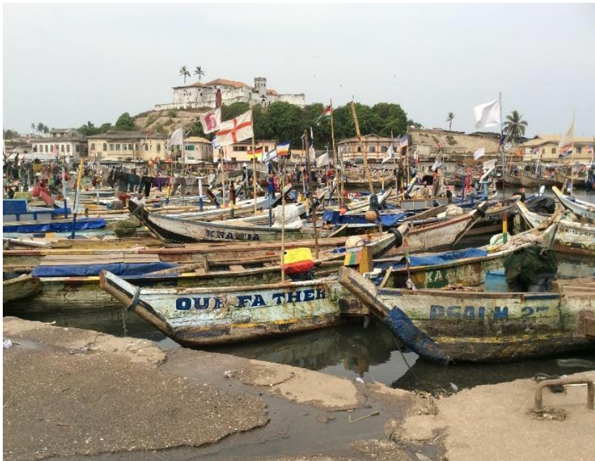
Figure 4. Boats docked on a Tuesday (no fishing day) at Elmina Beach

“What will we do if we don’t cut mangroves for the brush parks?” DAA PRA participant.