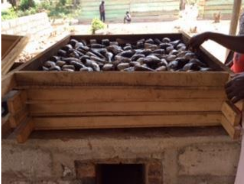
Figure 10. Stacked trays of fish smoked on Ahotor oven by CEWEFIA members