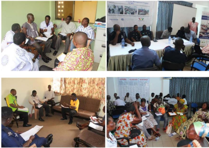
Figure 2 Group session discussions in the various regions