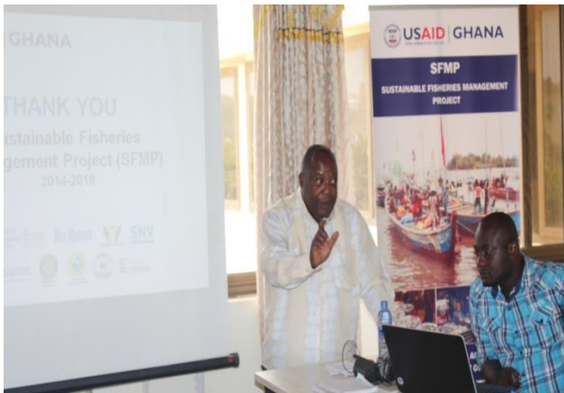
Figure 1 Resource persons delivering power point presentations to participants

The second presentation recapped the first round of stakeholder meetings and outlined all the choices made per each of the four regional meetings. In each region the presentation zoomed on the choice per that region and validated the choices made from the first round of meeting.