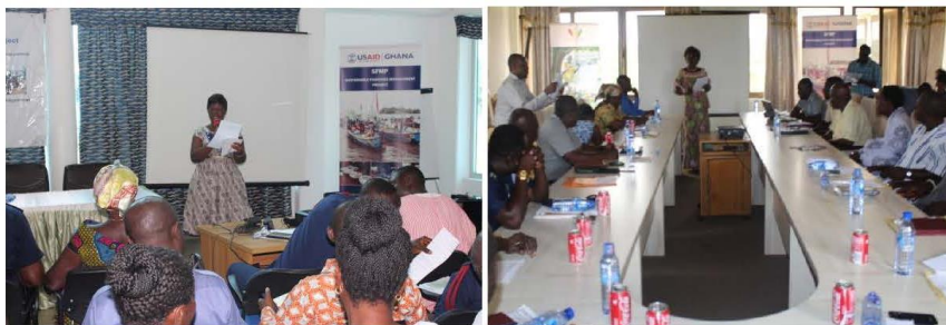
Figure 3 Participants presenting the outcomes of their group works at the plenary sessions

The proceedings from the group work session were presented at a plenary session by the representatives of each of the groups. The plenary session discussed the various presentations and provided input to refine the reasons for the options chosen and the recommendations made.