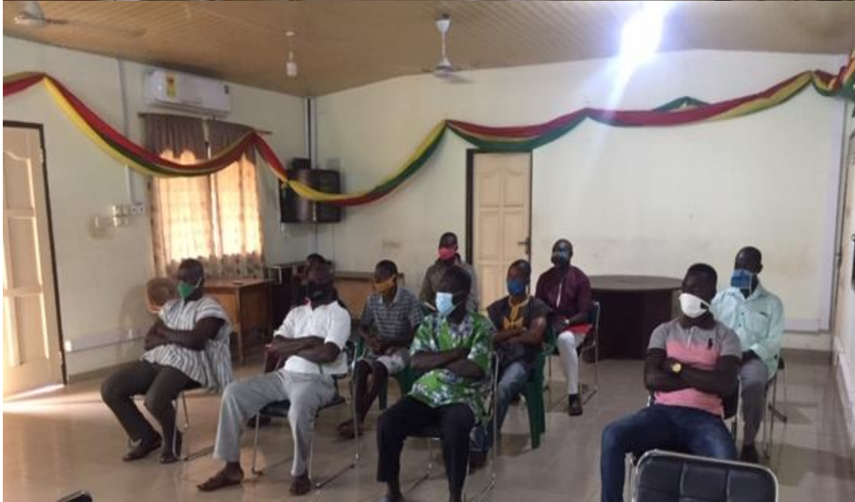
Figure 1 A cross section of participants at the Ada East, Ada West (top) and Ningo-Prampram districts (bottom) training workshop.