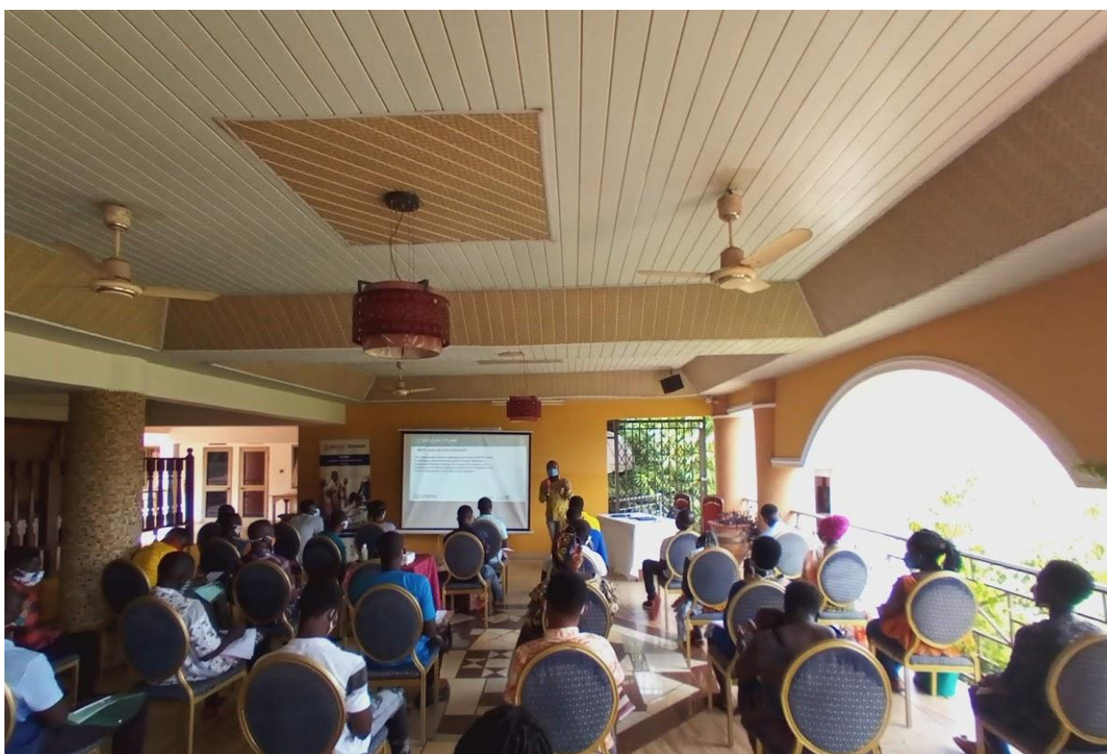
Figure 2 The Western region training workshop in session