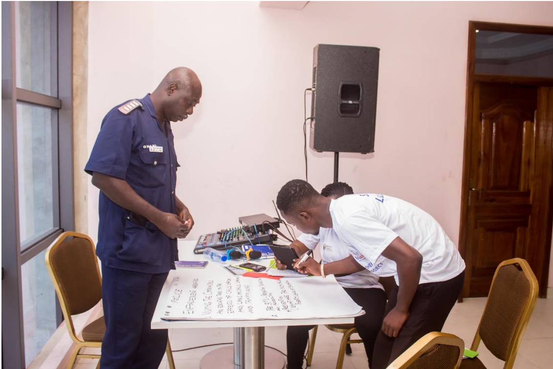
Figure 8. Law Enforcement Agency developing their Action Plan

Figure 9 shows example of a work plan or action plan developed by the various groups from the training. It highlights some of the various strategies to adopt in increasing advocacy in combating child labor and trafficking.