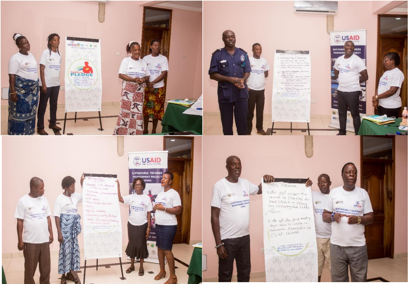
Figure 5. Various Groups presenting their action plan/work plan