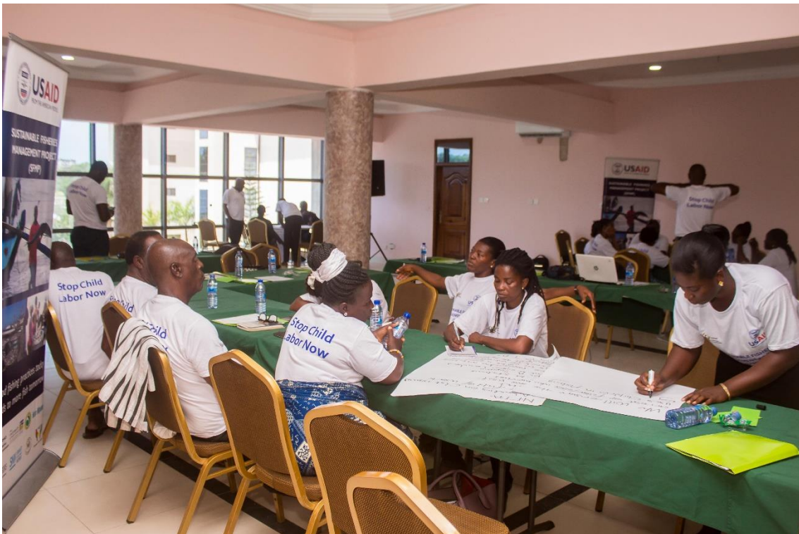
Figure 7. Fisheries Association Groups developing their action plan