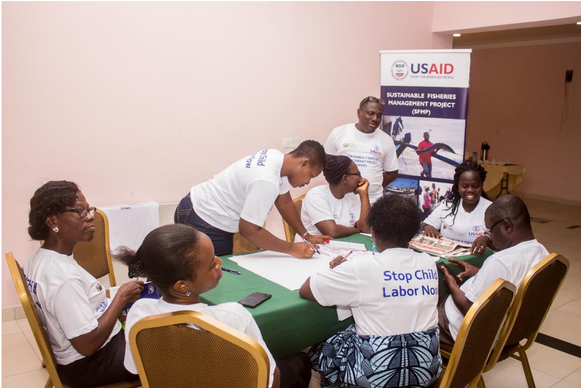
Figure 6. Group members deliberating on their action plan