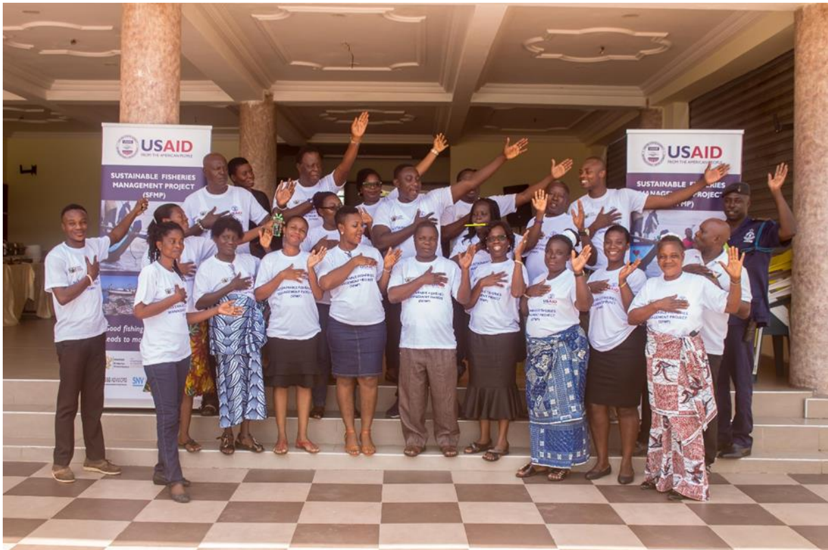
Figure 13. Group picture of participants chanting the slogan “Child Labor Away”

Whilst the training workshop was able to build participants' capacity, it was necessary that the communities lived up to the challenge of protecting children from exploitation by engaging in effective outreach work and developing action plans with clear strategies and monitoring systems. The level of understanding of the processes and stages demonstrated showed clearly that individual participants would like to see a change in their communities. It was necessary for support from implementing partners, CEWEFIA, FoN, DAA and their district assemblies to guide the process. Working closely with every stakeholder in the communities would be necessary to challenge the district assemblies to include anti-CLaT strategies in their work plans.