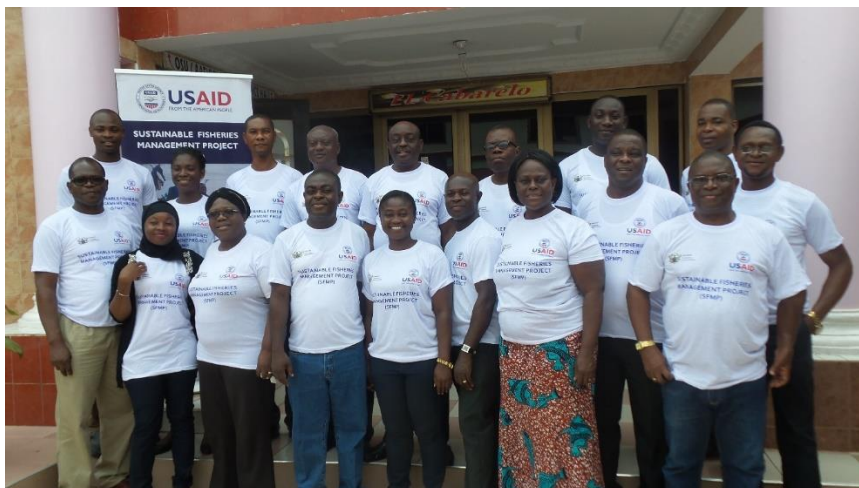
Figure 14. MoFAD/FC directors, support staff and facilitators in a group photograph after the training workshop

Lastly, when asked if their expectations for the training workshop were met, many answered 'yes' and said that now that they had gained more knowledge on CLaT, it was time to walk the talk.