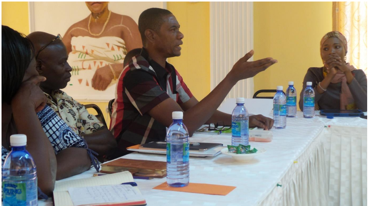
Figure 6. A participant sharing his CLaT experiences from his region