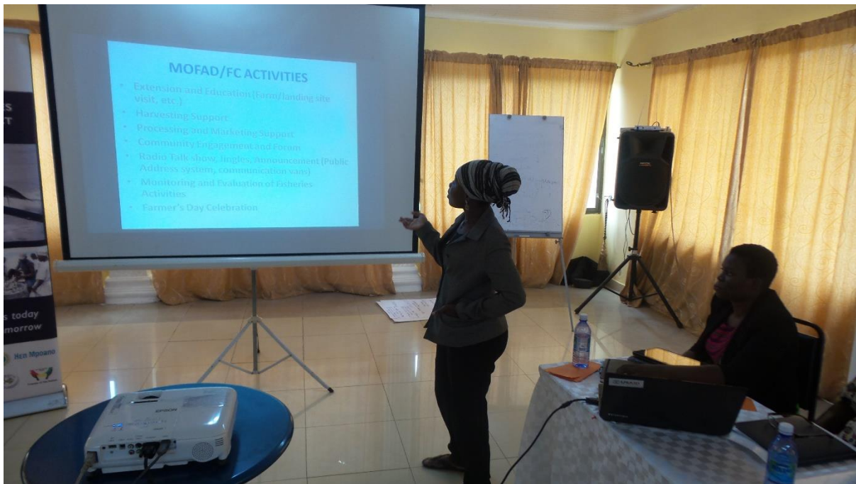
Figure 12. Presentation by group 1