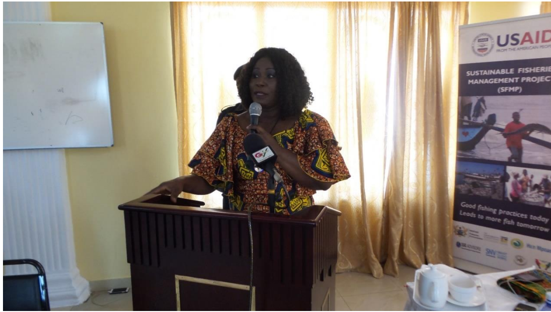
Figure 1. Hon. Elizabeth Naa Afoley Quaye, Minister of MoFAD giving the key note address