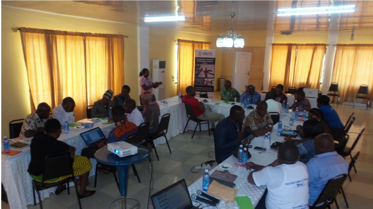
Figure 10. Cross section of participants during group discussion