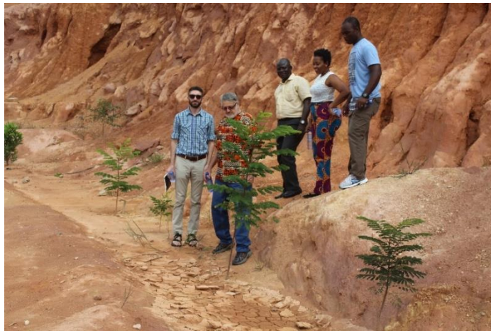
Photo 6: Bare degraded site typical of sites where tree planting was carried out in urban areas

of uncontrolled movement of livestock and the abilities of some “powerful” individuals to have their own way to destroy planted trees or vegetated public lands.