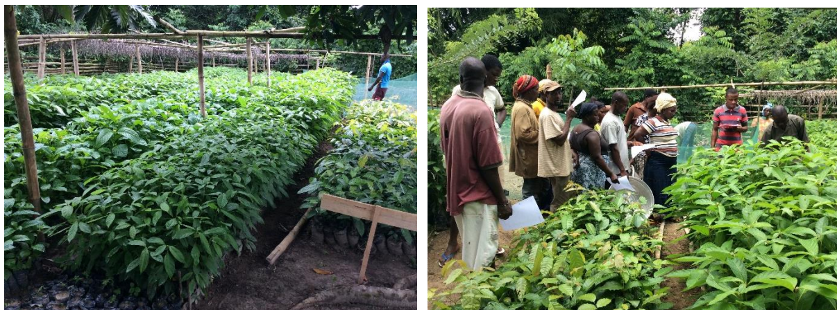
Photo 1: On the Left is a tree nursery established at Adubrim and on the right is group of farmers ready for lifting of the seedlings for out planting at Adubrim

The CSLP supported three communities to establish and manage tree nurseries to supply about 30,000 seedlings to farmers to out-plant. The nurseries were established at Adubrim (Photo 1), Tweakor 1 and Tumentu. Siting the nurseries in three different districts facilitated easy distribution and reduced seedling mortality. Community Assistants (CAs) were selected by the farmers to manage the nurseries on their behalf. Through coaching from CSLP, CAs acquired relevant knowledge and skills to manage tree nurseries.