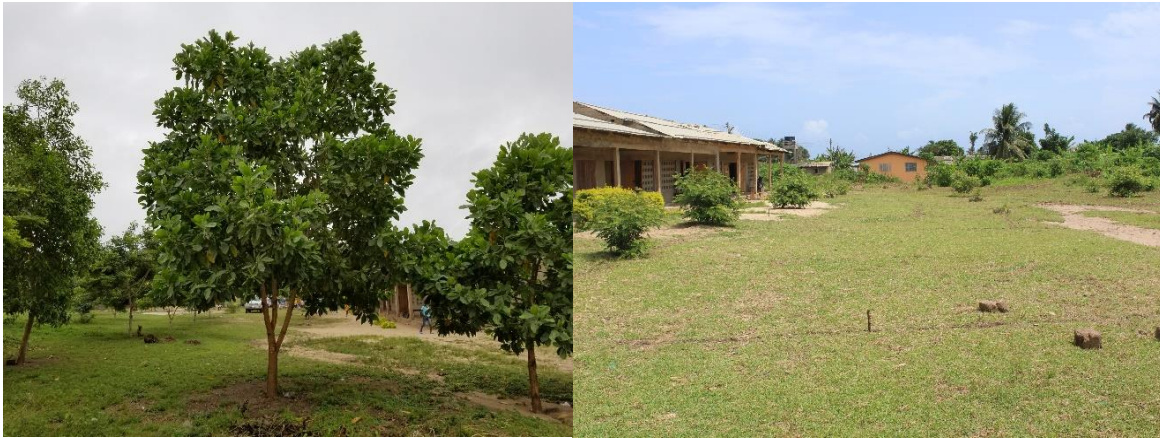
Photo 8: Agyeza school compound before tree planting in 2016 (right) and after two years in 2018 (left)