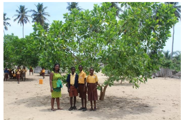
Photo 7: Tree planted on a bare sandy school compound at New Town in Jomoro district

where trees were planted posed major challenges. Most grounds were bare and unprotected from livestock (Photo 6). To date, 763 and 724 tree seedlings planted the year 2016 survived at Shama and Jomoro schools respectively. These have survived in areas where the school were walled or effectively fenced to prevent stray livestock from destroying the trees, where there was strict enforcement of community regulations on livestock and to some extent, diligence of teachers and pupils in taking care of the planted trees. Indeed, some of the trees have thrived even in very difficult environment such as at New Town Primary School in Jomoro District (Photo 7)