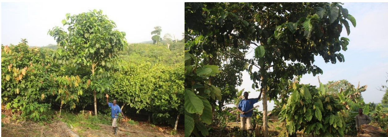
Photo 5: Ali of Ayawora planted Nauclea diderrichii or kusia on the left side photo and also has additional trees of the same species through FMNR (right)

This practice works well with species like odum, ofram, emire, kusia, otie, kyenkyen