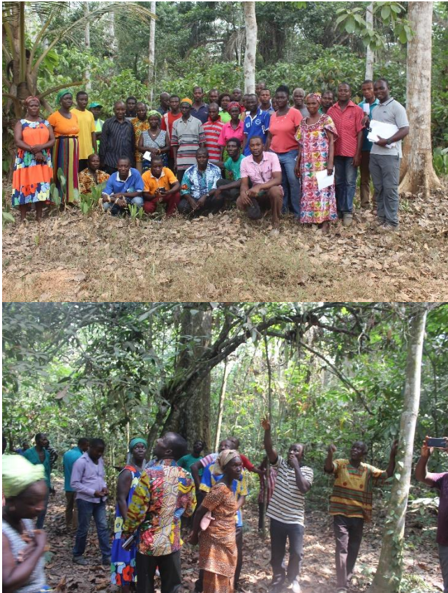
Photo 2: Group photo of tour participants at an agroforestry site near Samreboi (top) and tour site near Tarkwa (bottom)

A training tour to Oda-Kotoamso Agroforestry site near Samreboi and also to Mile 9 near Tarkwa were organized for selected community champion farmers (Photo 2). This offered the “champions” a practical perspective of planting timber trees in cocoa farms and other practices such as enrichment planting. It also provided a rare opportunity to farmers to learn from other agroforestry farmers, benefits they have gained from decades of agroforestry practices.