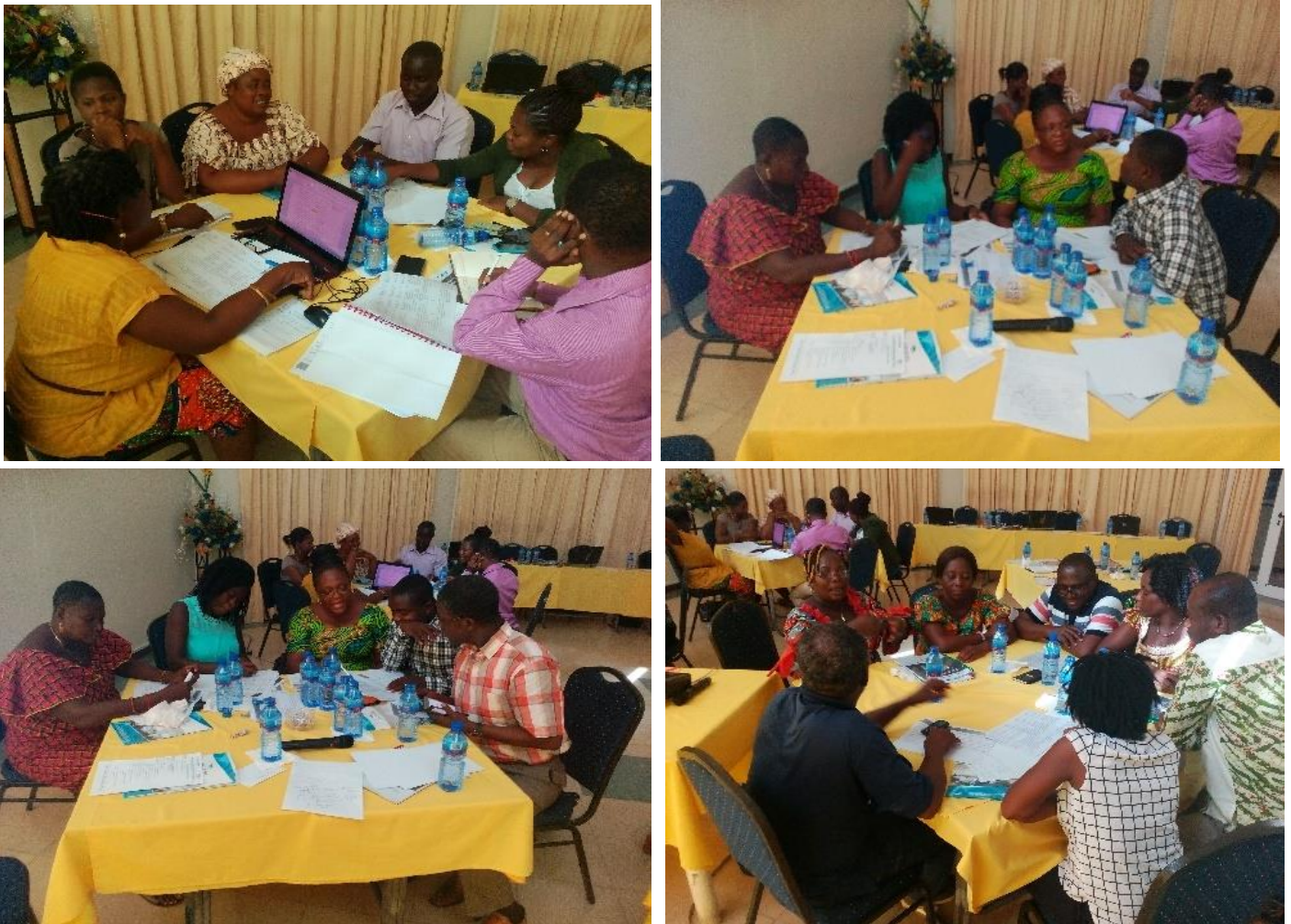
Figure 3: The four groups brainstorming over the Study Results

Each group made a presentation on the outcome of their brainstorming session and shared their observations of the findings of the study. Key issues identified were; the need to have a standard conversion for cartons and pans, further analysis on the production volume based on the business working capital and the need to have more graphics in the report so the report could easily be assimilated by readers.